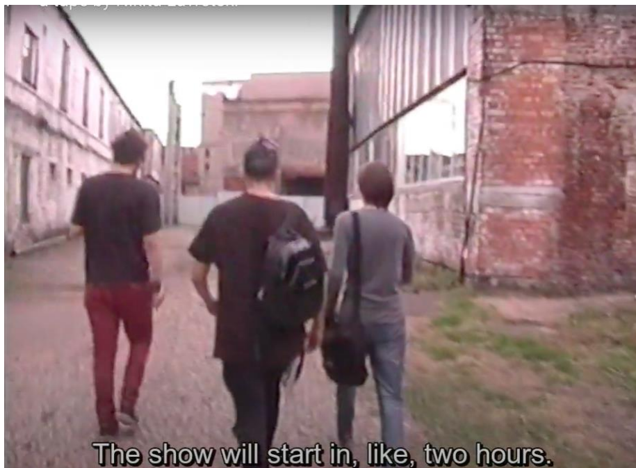
Figures 20 and 21. Sasha's Hell (Lavretski, 2019)