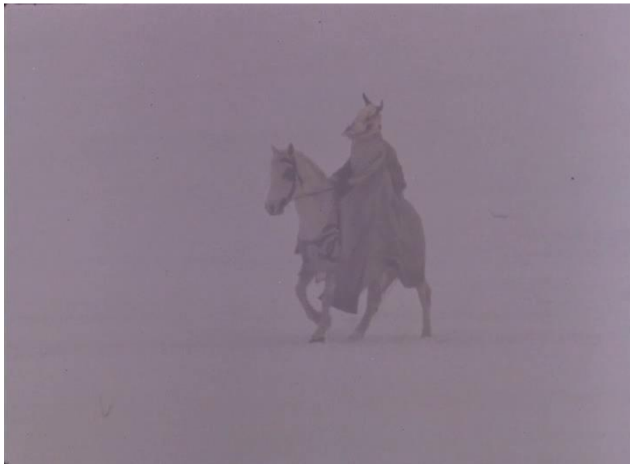
Figures 6 and 7. The Savage Hunt of King Stakb (Rubinchik 1980).