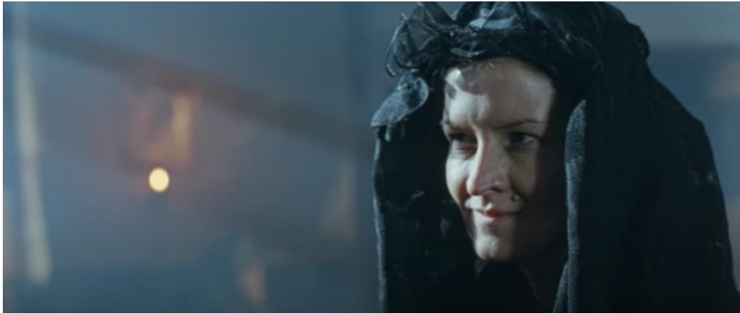
Figure 12. Masakra (Kudzinenka, 2004)

fragile and flammable, falling apart like they are made of sand and serving as the fuel for the final masakra . I believe the straw objects represent the disconnect at the heart of our characters' struggle. Like the straw puppets of the ghostly hunt, they represent the failure of Belarusian landed gentry to be faithful stewards of the land. The Belarusian nobility like the count or his fiancée appear to have a tortured relationship to the land that surrounds them and people who live on it. The count exemplifies it particularly clearly: his desire to escape the curse is a desire to stop being who he is, which is both a bear and a Belarusian. The same can be said about Anna: not only she is ambivalent about her engagement, but her escape and return are not of her making. Instead, her descent into insanity is engineered by the local women. One of them approaches Anna in the church and urges her to return to the mansion because Anna is the only one able to set things right. The woman then utters the word “ masakra ” with a satisfying smirk.