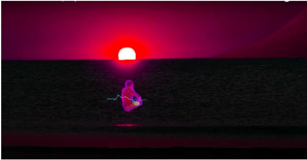
Figure 16. Sasha's Hell (Lavretski, 2019)