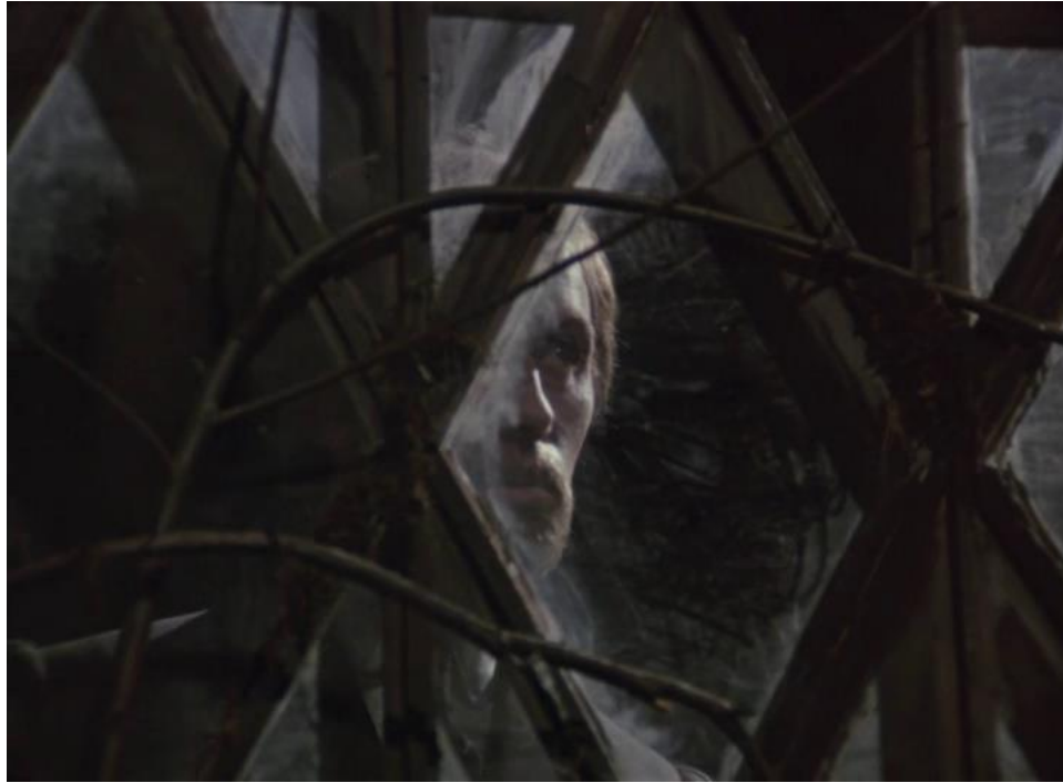
Figure 4. The Savage Hunt of King Stakh (Rubinchik 1980).

These obscured, partial views are usually presented at a moderately low angle as if the camera were peeping in on the action from the height of a tall child. The camera work, in short, destabilizes the assumptions of agency and perspective in the film. We never find out who is watching from the camera POV, and the film consciously teases the viewer about it. The Hunt features a little person character, the brother of the housekeeper hidden in the dungeons of the mansion, who initially is presumed to be a vengeful “little man” spirit haunting the countess. When the brother is discovered by the others, we quickly realize that it is not his perspective we see. In fact, we never find out whose obstructed perspective the camera adopts so rigorously in so many sequences in the film. I believe the film intentionally plays with the conventions of knowable and visible, erecting barriers to visibility and casting doubt on what is truly knowable in the story.