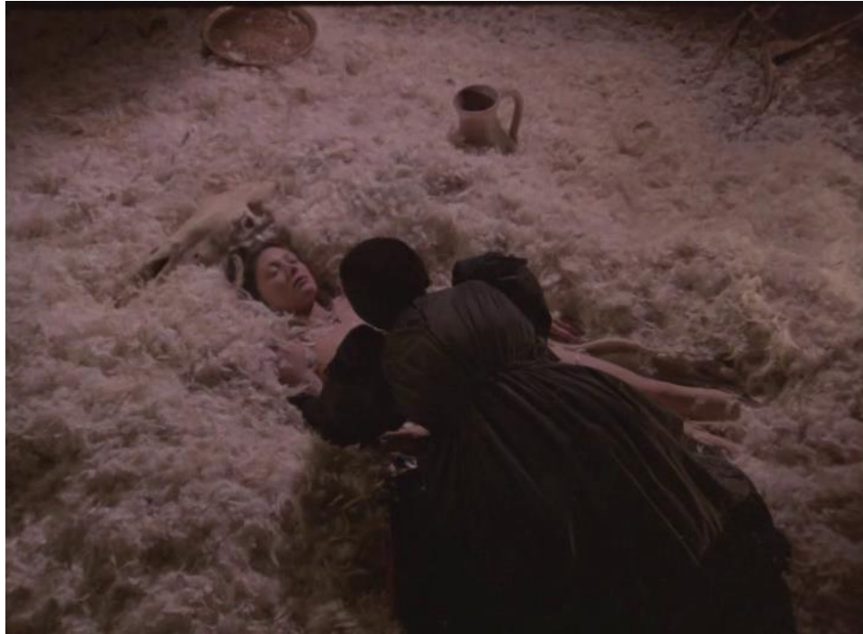
Figure 5. The Savage Hunt of King Stakb (Rubinchik 1980).

latent or imminent epistemology, but rather as intentionally obscured and silenced. To that point, early in the film there is a scene when our protagonist accidentally spies on the countess. He sees her naked and asleep, laid in the large pile of feathers with an old woman muttering some sort of incantations over her.