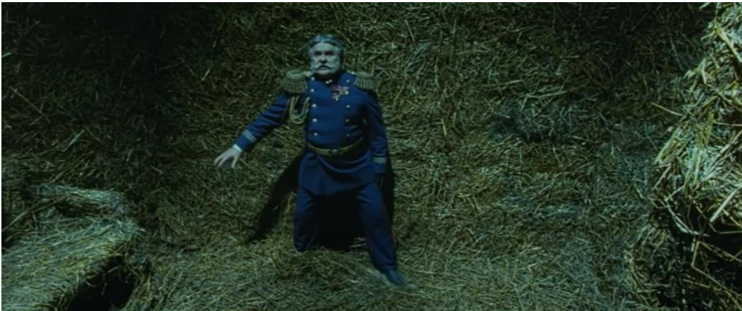
Figures 10 and 11. Masakra (Kudzinienka, 2004)

The introduction of straw in Masakra does not seem to be connected to the incursion of nature like in The Hunt , where the creeping vegetation symbolized decay and outmodedness. The prominence of straw is less self-explanatory. Everyday objects and architectural features made of straw are