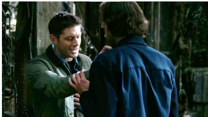
Figures 8 and 9: Dean just before he dies in Sam's arms in "Carry On" (15.20)