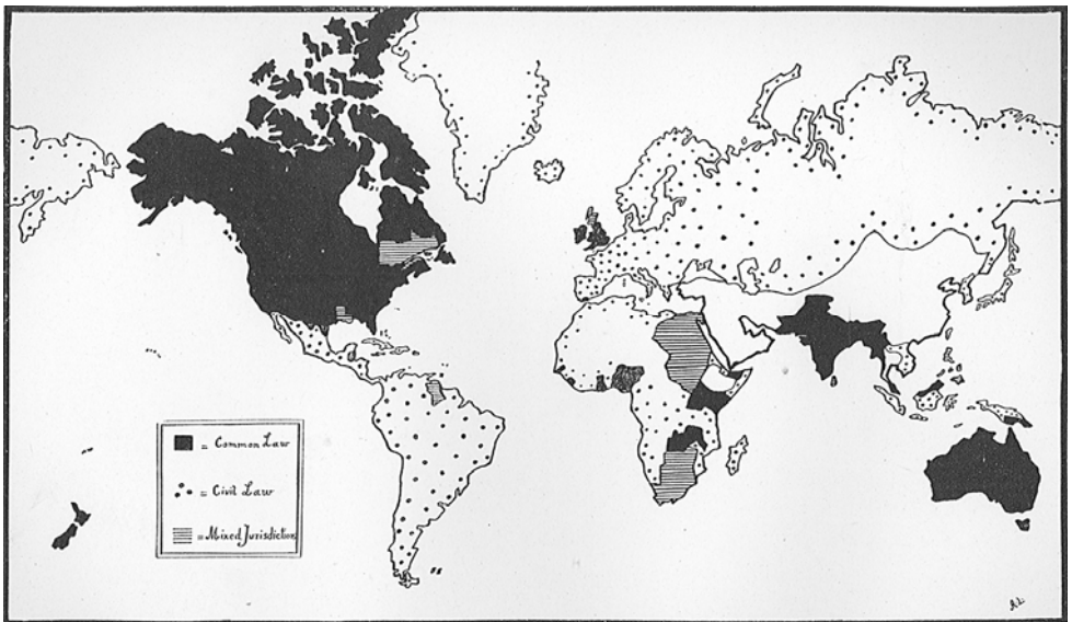
Figure 1: The Civil Law and the Common Law—A World Survey

Below is his map, partly written in his own hand, with his initials showing in the right hand corner.