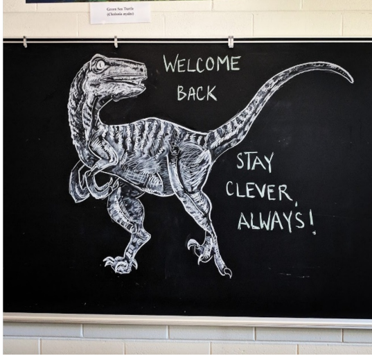
FIGURE 1: Welcome message to new science students drawn in chalk

deciding which piece of art she will draw for students on the chalkboard of her classroom in Gatineau, Quebec. Sometimes the pictures relate to teaching the biology courses she is assigned, and sometimes not. This year, she decides to welcome her grade nine students with a humorous drawing of the velociraptor from Jurassic Park (Figure 1).