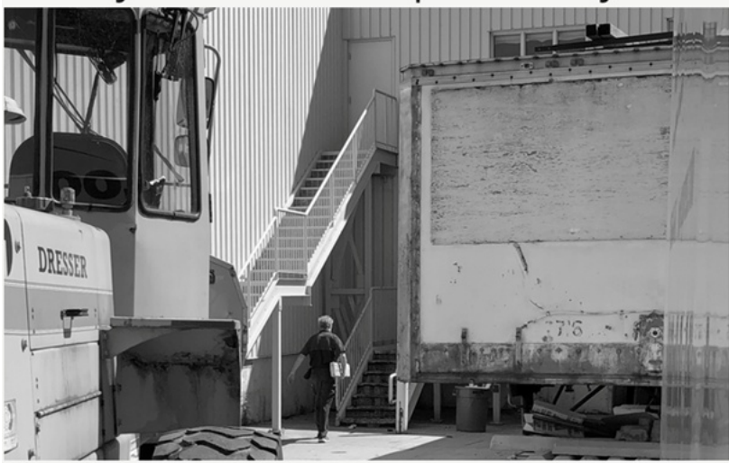
FIGURE 2. Bob delivering a firearm to a Canadian Tire store

Rural Delivery. For the first stop past Oromocto after lunch, Gary stops in the Village of Gagetown to make a delivery (Goodfood). After taking the Trans-Canada highway out of Oromocto, Bob leaves the highway to deliver one parcel of Goodfood to a household.