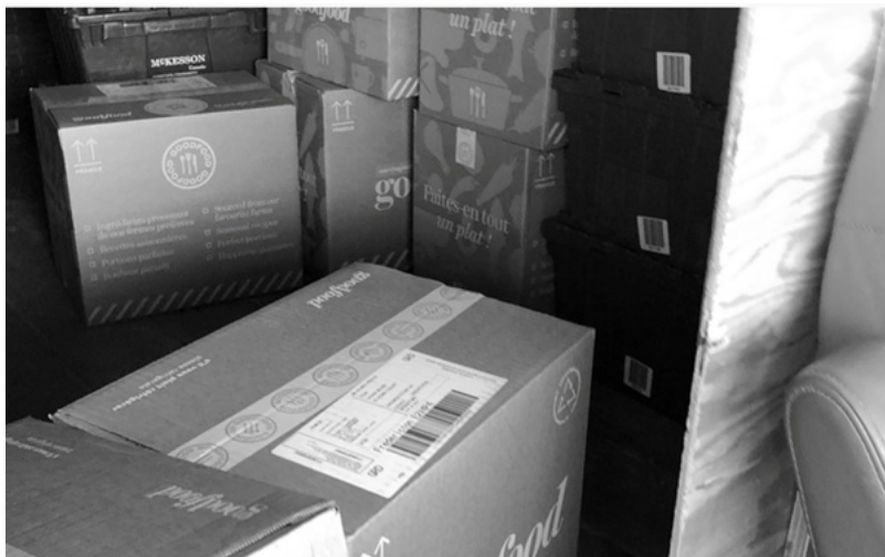
FIGURE 4. Looking back into Bob's truck

speed possible for about 15 minutes before leaving the highway at the Village of Gagetown exit. He then drove for about 20 minutes to make the delivery, then back to the highway. All that driving and burned hydrocarbons for just one parcel: there's no such thing as "free shipping" when it comes to the planet.