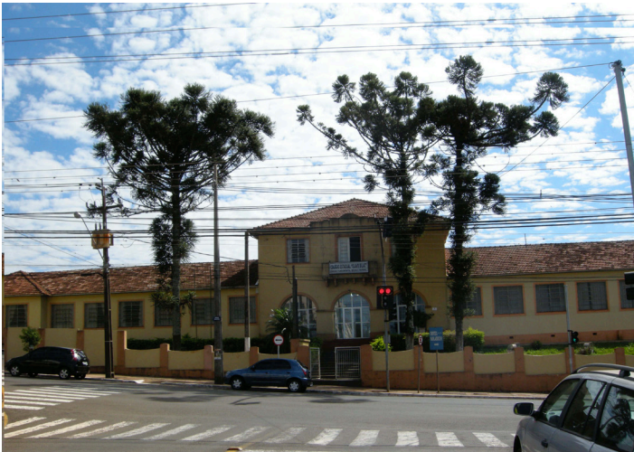
FIGURE 2. Normal school of Cambé

In Brazil, the training of elementary teachers has remained largely in the domain of normal schools (Coutinho, 1992) or at least this was the case in Cambé. Certification of teachers occurs at the municipal level in Brazil. Young people who intend to be future teachers decide on their chosen vocation by as young as 15 years old, while they are still in high school. They then apply to normal school.