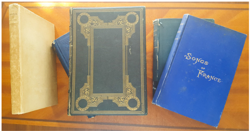
Figure 1: From left to right: Griswold's "pretty parchment-covered Philadelphia volume" (1844), Young's un-illustrated cloth and large-paper morocco issues (1850), and Sauveur's textbook (1889) and its limited-edition translation (1894).

The rest of the songs in the anthology are indeed based on songs in standard collections of the works of Béranger, but they often bear little resemblance to the original. As Park Benjamin noted in the Columbian Lady's and Gentleman's Magazine : "There has been a collection of translations, so-called, published recently in Philadelphia. ... But the pieces in the pretty, parchment-covered Philadelphia volume (Fig. 1) should, for the most part, be entitled 'Lines suggested by such and such a song of de Béranger." 122