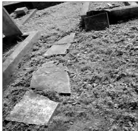
Fig. 3 Fragments of headstones belonging to three Chinese graves.

A few inscriptions on the headstones are legible (see Fig. 4, 5, and 6 for example), while some are difficult or even impossible to identify completely. From the twenty-three dates of death we were able to collect, we determined that the basic sequence of the burials runs from grave 26 (April 2, 1922) to grave 1 (October 12, 1942). With this order in mind, the original locations of the fragments in the bottom left-hand side can be surmised. The fragment with the date of death of August 14, 1922 probably belongs to grave 18, and the other fragment with the date of May 15, 1929 was likely originally on grave 22. In the same way, we inferred that marker 27 should be on grave 7. The fragment of stone without a date bears the name of the deceased, Gong Kee. Since there is only one unmarked plot left, it is very probable that it is from grave 13. Therefore, although the information available for each headstone varies, we have been able to identify all twenty-five graves and their respective headstones. Building on the premise that mortuary studies can provide