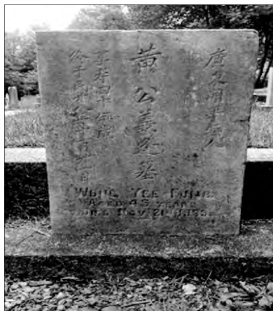
Fig. 6 Headstone of Wong Yee Fung.

glimpses into the minds of past peoples (see Rouse 2005: 82), I argue that these headstones can help trace stories of the early Chinese community of St. John's and reflect the formation of Chinese immigrants' transnational identity.