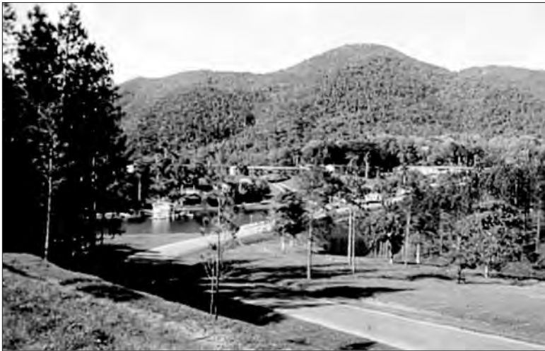
Fig 2 Moka Hotel in the "Las Terrazas."

living and working with tourism related activities.