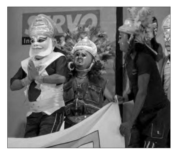
Fig. 5a, 5b MacbethsPurulia 2011.