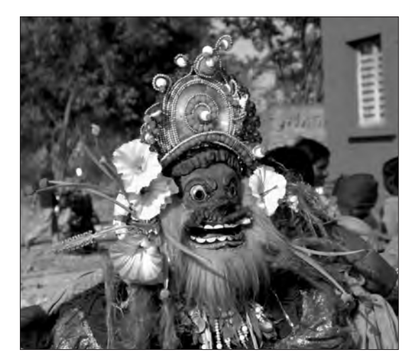
Fig. 1a (left) Asura (demon) chhau Mask, village performance, Purulia, 2011.

For years, artists have been performing in village streets and courtyards accompanied by Jhumur<sup>7</sup> songs and music. The chhau show can last all night with two or three groups of ten to fifteen dancers each (depending on the festival, the stories and the contract) performing in a contest. Although originally "ekaira chhau" (the solo performance of the hero) was very famous, today Purulia chhau at the village level is more a group acrobatic and sometimes a synchronized theatrical dance. Artists move their body up and down on the ground. They make turns in the air