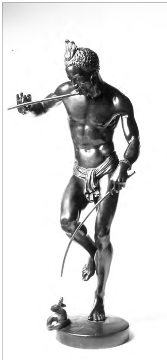
Fig. 3 Charles-Arthur Bourgeois, Snake Charmer , modelled 1863 (bronze, New York, Dahesh Museum of Art) © Dahesh Museum of Art, New York, USA / The Bridgeman Art Library.

they would have been Orientalist rather than ethnographic.