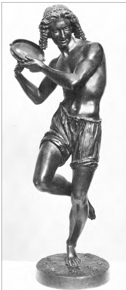
Fig. 2 Francisque-Joseph Duret, Dancing Neapolitan Boy , modelled 1838 (bronze, location unknown). Photograph illustrated in Ruth Mirolli and Jane Van Nimmen, Nineteenth Century French Sculpture: Monuments for the Middle Class , exh. cat. (Louisville: J. B. Speed Art Museum, 1971), 168, at which time the sculpture, a reduction of the original, belonged to the now defunct Heim Gallery in London.

which he holds in a position similar to the Snake Charmer's flute, was exhibited at the 1838 Salon. It was designed as a pendant, with the stance inverted, to Duret's Young Fisherman Dancing the Tarantella (Souvenir of Naples) (1833, Paris, Louvre) (Fusco and Janson 1980: 248). As with