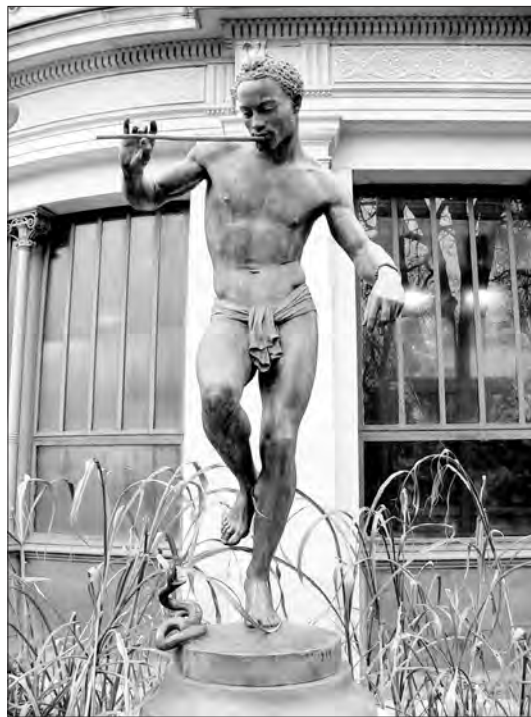
Fig. 1 Charles-Arthur Bourgeois, Snake Charmer , 1864 (bronze, Paris, Ménagerie du Muséum National d'Histoire Naturelle).

There is relatively little biographical material on Bourgeois, who died at the age of forty-eight, but there is no evidence that he—unlike his compatriot artists Frédéric-Auguste Bartholdi, Charles Cordier, Eugène Fromentin, Jean-Léon Gérôme, and others—travelled to the Orient. Napoleon Bonaparte's invasion of Egypt in 1798, however, had led to an ongoing French fascination with Egypt, North Africa, and the Near East. A wide variety of sources of information about