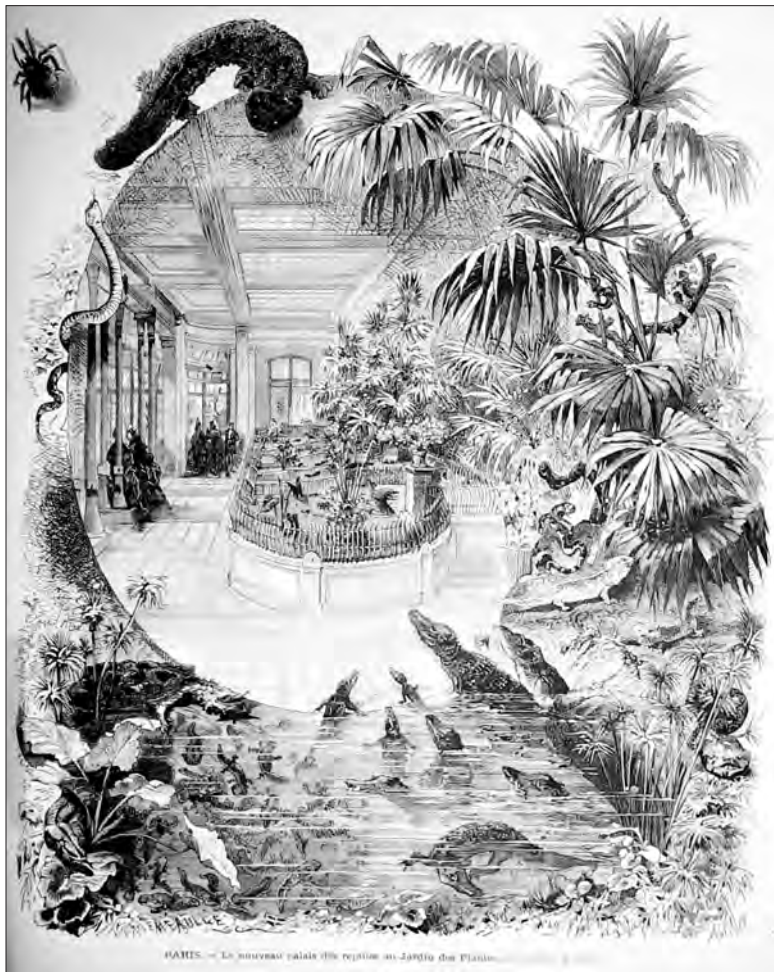
Fig. 5 H. Scott, The New Palace of Reptiles at the Jardin des Plantes. Illustrated on the cover of Le Monde illustré 18 (915) (October 24, 1874).

In terms of its architecture, the reptile house or “palais des reptiles” (de Fonvielle 1874: 262), as it was referred to by some, was simultaneously neoclassical, modern, and decidedly French. Described as “fort élégant et coquet” (most elegant and stylish) (de Langeac 1873: 583), the building was made of stone, iron, cast iron, marble, and slate, and André was particularly proud of the quality of the stonework. The stone came from France, as did the knowledge of how to lay it properly. The building’s neoclassical details, including the virtually blank frieze, the parapet necking that resembles a necklace string, the stone Corinthian pilasters, and the cast-iron Ionic columns in the intercolumniations of the window bays, reflect André’s Beaux-Art training, as well as a certain preciousness. At the same time, the petite size of the cast-iron columns suggests the understanding of an engineer regarding the capacities of that new material. One major feature contributing to the modernity of the building,