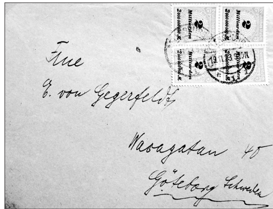
Fig. 1 Letter sent from Germany to Sweden, on November 19, 1923, during the German inflation period, franked with a total of 8 billion (“milliard”) German marks.

(2) A sociological motivation may be summarized as a desire to augment one's social status. Bourdieu demonstrated the link between the taste