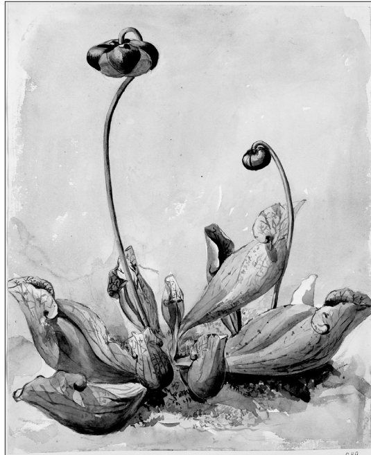
Fig. 8 (Right) Pitcher Plant with two Blooms; Peter Winkworth Collection of Canadiana, R9266. Library and Archives Canada.

Figs. 6, 7 (Opposite) Gus Yellow shaping lacrosse stick with bending machine; Six Nations Indian Reserve, Ontario (1884), 18841); Canadian Museum of Civilization, F.W. Waugh, 1912.