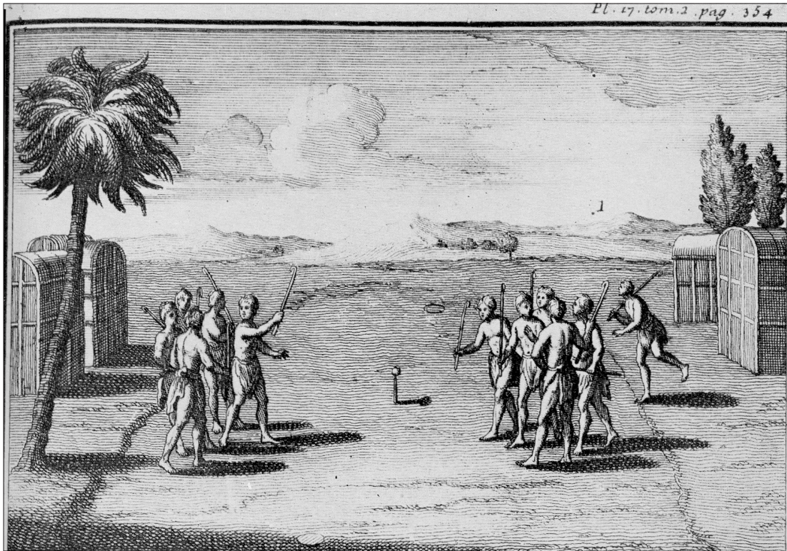
Fig. 2 A game of Lacrosse; Plate XVI in Customs of the American Indians Compared with the Customs of Primitive Times by Father Joseph François Lafitau.

longer necessary for settling territorial disagreements (2002: 20-21). Also, the introduction and acceptance of Christianity shaped the ways in which lacrosse was played by some Onkwehonwe communities. As missionaries among the Mohawk of Caughnawagha in the early 18th century disapproved of lacrosse as a means to honour the Creator, the spiritual motivations for playing lacrosse were largely replaced by an understanding of the game as a sport (North American Indian Travelling College 1978: 35). There is evidence that other Onkwehonwe communities, however, continued to play lacrosse ceremonially. For example, in his 1898 Report for Ontario's Minister of Education, archaeologist David Boyle remarked that while visiting Six Nations, "a dance was given and a game of lacrosse played for the recovery of a young man of the Upper Cayugas, who was ill with lung trouble" (1898: 85).