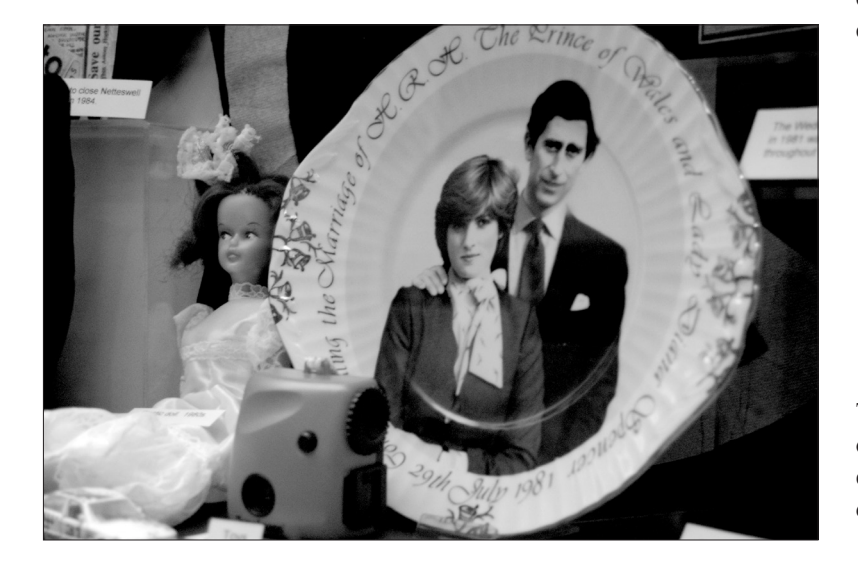
Material Culture Review 73 (Spring 2011) / Revue de la culture matérielle 73 (printemps 2011)

and Lady Diana Spencer's 1981 commemorative wedding plate, beside a plastic bridal doll and an early 1990s camera.