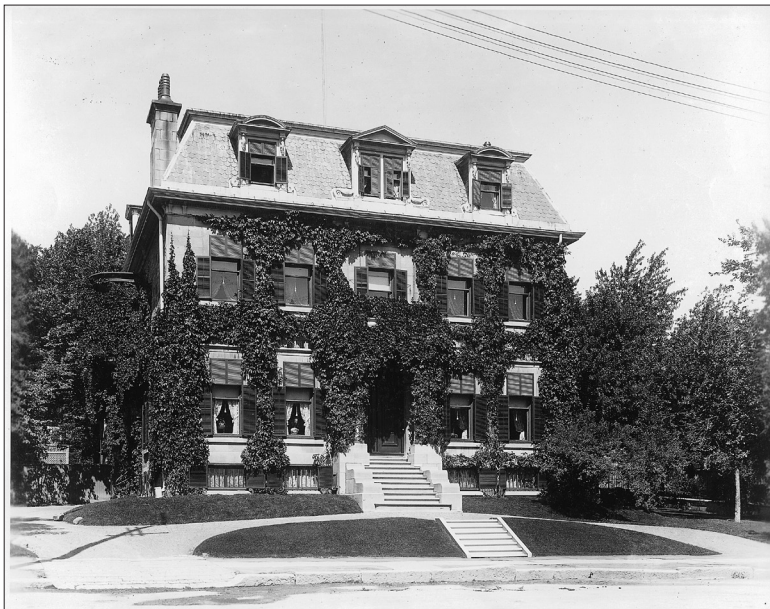
Fig. 2 The Redpath mansion was typical of upper-class architecture in Montreal's affluent Square Mile. Mrs. John Redpath's House, Sherbrooke Street, Montreal, QC, 1899. Wm. Notman & Son, Musée McCord Museum, II-129781.