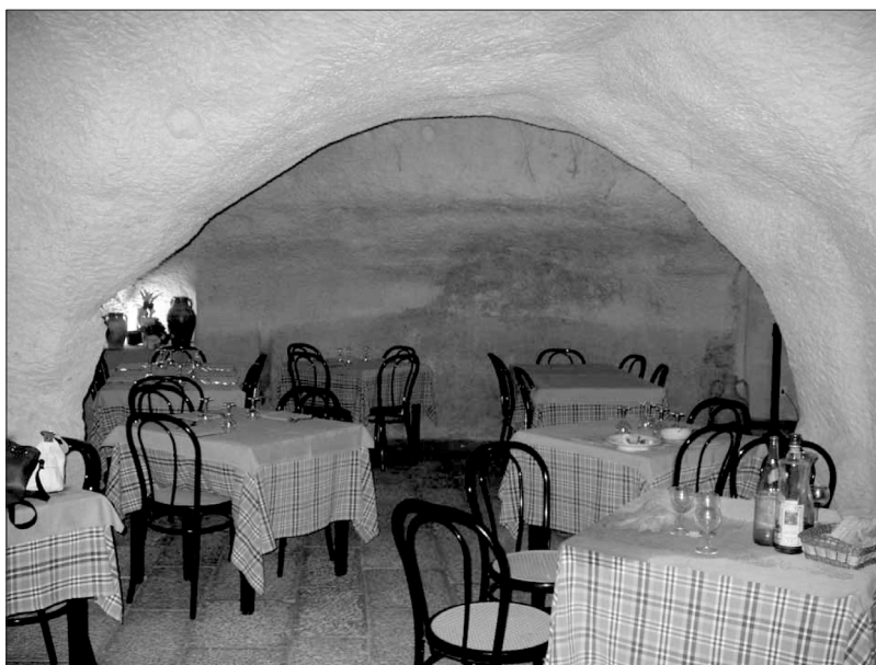
Fig. 7 Peasant-themed restaurant interior in the Sassi.

The Tourist Circuit: Tourism depends upon guidebooks and other travel literature, news media, films, documentaries and such promoters as city leaders to put destinations “on the map” (literally and figuratively) by generating public awareness of them. These agents create the space of tourism 11 by producing the sites and circuits of tourism.