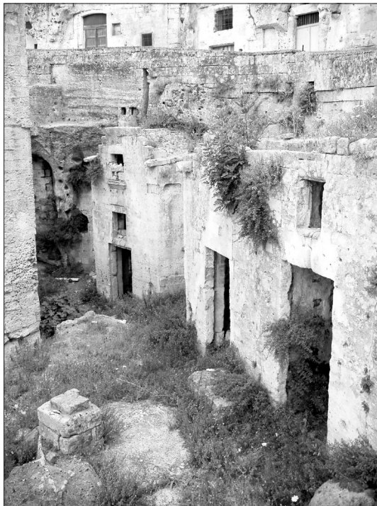
Fig. 6 Detail of abandoned Sassi as they look today.

A third finding is that media establish tourist circuits and define tourists' knowledge and perceptions of places. Tourists, in turn, perpetuate the circulation