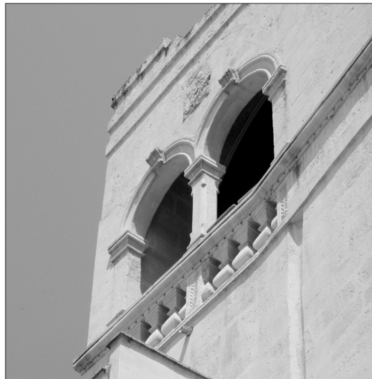
Fig. 2 Renaissance ornamentation on a Sassi palazzo (A. Toxey, 2006).

the “Capital of Peasant Civilization” and a locus of premodernity. 4