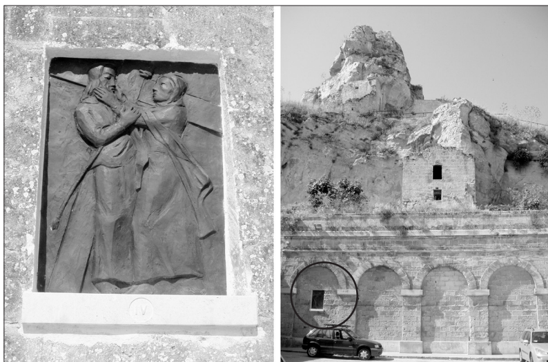
Fig. 10 Lions Club bronze plaques (detail on left; distant view on right) establish a Via Crucis in the Sassi.

This example exposes the power involved in interpreting and marking the history of a place when competing agendas produce contested memories. As well as previously discussed examples, it also illustrates the inertia of perceptions, memories and