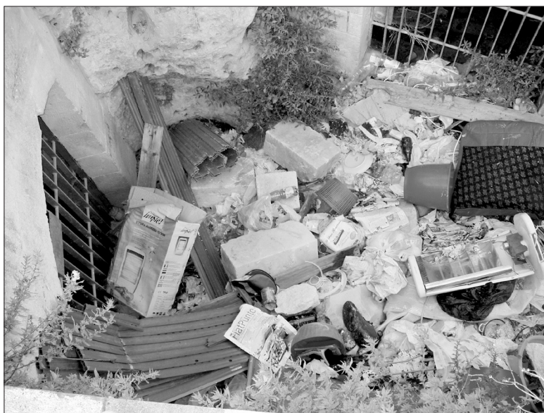
Fig. 11 Continued use of the Sassi as a public dump (A. Toxey, 2002).

A quieter yet more visible controversy over Sassi ownership and identity and the physical display of