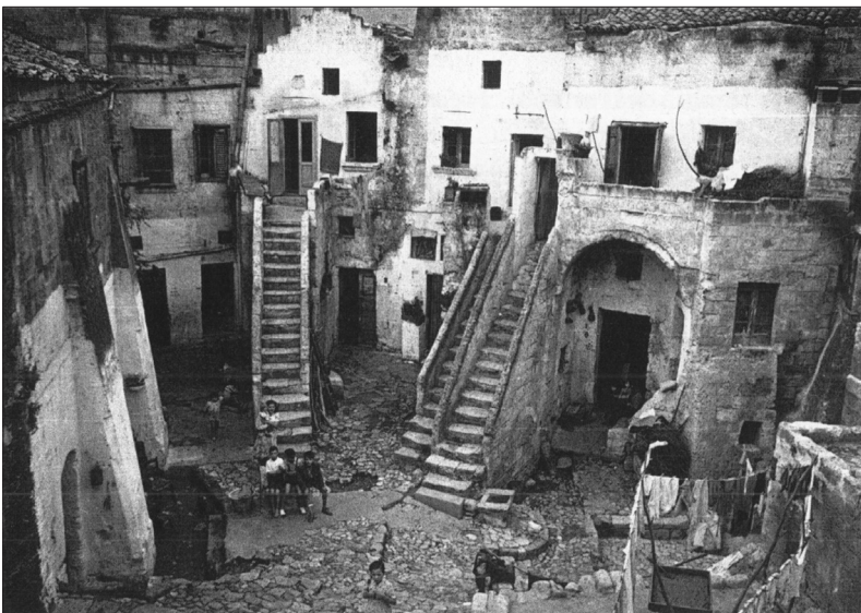
Fig. 5 Detail of the Sassi as they looked ca. 1950 before the population was evacuated.

Naming and Reclaiming the Ruin: By 1990 when I first visited Matera, the Sassi were in ruins. Despite the fact that three decades of lobbying by Matera's intellectual elite (assisted, ironically, by Carlo Levi) had brought about the passage of two state laws that named the Sassi a national monument and provided funds for preservation, little conservation took place before 1993, when the Sassi entered the World Heritage List. This act returned Matera to world interest and initiated a new narrative. From being the focus of negative press and a national discourse of shame in the 1940s and 1950s and dropping into anonymity in the following decades, Matera then became the focus of positive press in the 1990s and a subject shaped in discourses of national and global heritage. A flood of news articles and television documentaries followed. Municipal tourism offices and initiatives were established,