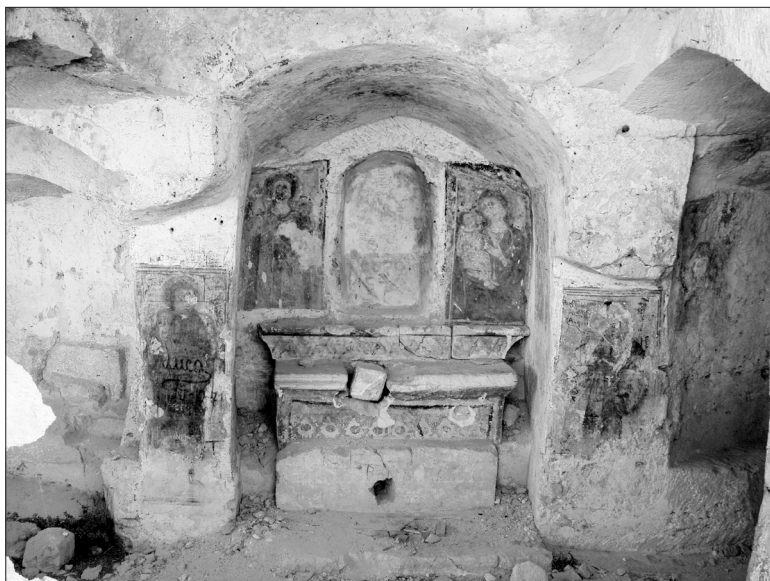
Fig. 3 Frescoed rock church outside Matera.

Despite their abandonment and burial under heaps of scorn and debris, a movement to preserve the Sassi developed in the 1960s and has maintained momentum. It started as a grassroots effort by local elite (not the shamed, displaced Sassi residents) and achieved national support with the passage of a law in 1967 naming the Sassi a national monument, followed by another law in 1986 that provided national funds for preservation. At this point, the city commissioned architect Pietro Laureano to develop a study of the Sassi and submit it to UNESCO for world heritage candidature. A native Materan, Laureano had spent his career as a UNESCO consultant working with cultural heritage in Africa. His proposal was accepted and the Sassi entered the revered list in December 1993.