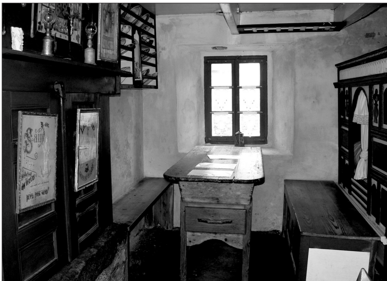
Fig. 8 Box beds face the table and hearth in the Écomusée Niou.

La Maison du Niou Uhella (Fig. 7) the “premier ecomuseum of France” (Davis 2005: 368) opened in July of 1968, prior to the invention of the category. This building, in the tiny hamlet of Niou Uhella on Ouessant later became the centrepiece of the Écomusée de l’Île d’Ouessant. It is a slate-roofed, stone cottage, in which compartmentalized spaces of two rooms served as kitchen, dining room and bedroom are typical of house styles ca. 1900 (at about this time of relative prosperity, many families replaced thatch roofs with slate (Péron 1994: 32)).