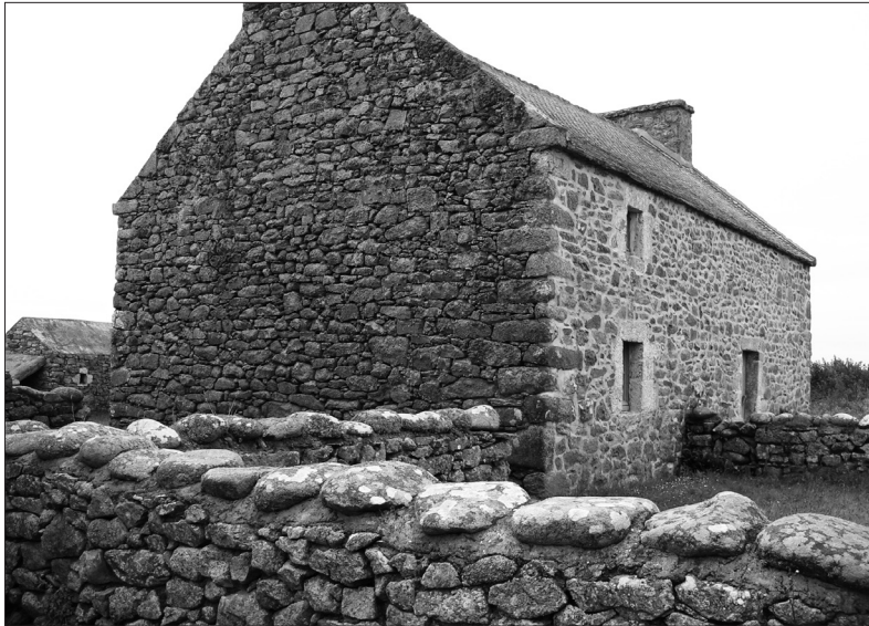
Fig. 7 Écomusée Niou, Ouessant, June 2006.

Many ecomuseums, likewise, encourage the visitor to make contact with various “antennae” sites in the landscape that inform an intangible sense of place that the museum aims to conserve and promote (Davis 2005: 368).