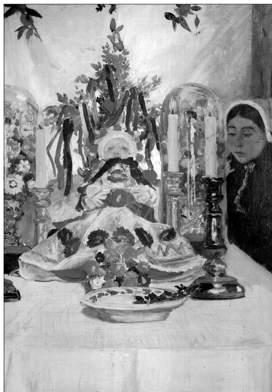
Fig. 12 Charles Cottet, Wake of a Dead Child on Ouessant (1897) Quimper Museum of Fine Arts. Photo by author, October 1997.

The text at Niou (quoted above) speaks of the banality of infant mortality in the late 19th and early 20th century, a time when such loss was more acceptable and representable. Historian of the island, Françoise Péron (1997) reiterates the ecomuseum's assessment of Cottet's painting, that the death of an infant was not a sad affair at the time, as he or she was ensured to go straight to heaven. She also tells us that this attitude on the part of the Islanders seemed monstrous to outside observers (222). In its presentation of the material culture of death, mourning and memory, the Niou ecomuseum displays its marriage globes both as objects that bore material witness to crucial moments in the life of the family, and as objects that served to represent Ouessantine customs to the outside world.