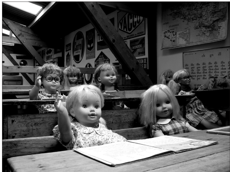
Fig. 9 (Top) A Breton interior at the Lizio Ecomuseum.