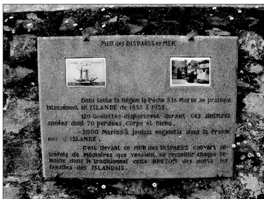
Fig. 13 (Top) The Day of the Dead at the Wall of the Disappeared at Sea. Ploubazlanec. L'illustration 31 Oct 1891.