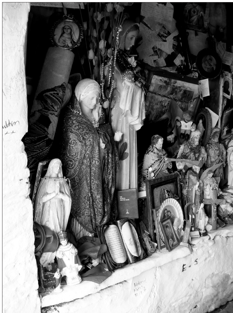
Fig. 6 Accumulated votive "gifts" at St. Brigid's Well, Liscannor, Co. Clare, Ireland, June 2007.

An ecomuseum's success was to depend upon community agreement, support and involvement; it promised to give back to the community by