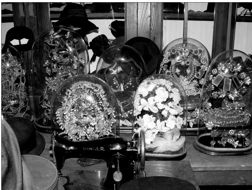
Fig. 11 Marriage Globes, Lizio, May 2008.

The ecomuseum of Lizio presents its collection of marriage globes (Fig. 11)—both in its packed display spaces and on its website—accompanied by explanatory texts that outline the specific iconography of flowers, mirrors, porcelain angels, gilded metal and small birds and the ways the combination of these objects might narrate a biography of the woman who assembled it. In Lizio, amid hat boxes, ancient sewing machines, coffee tins and bicycles, the group of marriage globes no longer seem to speak to individual experience: they demonstrate a range of types marked by continuity of arrangement and variation of detail. Like the material fragments enshrined in a reliquary, the dusty contents today seem to have, to use the words of historian Patrick J. Geary (1995: 174) “no obvious value apart from a very specific set of shared beliefs . . . once removed from their elaborate reliquaries or containers, they [are] not even decorative.” Having been removed from the everyday world of personal experience—