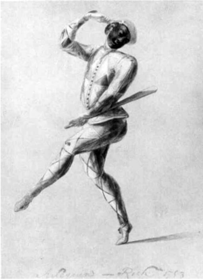
Illustration 2: John Rich in 1753. Artist unknown (courtesy of the Collection of the Garrick Club, G0716).