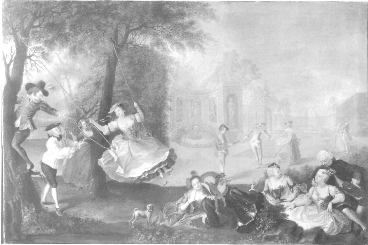
Figure 2. Anna Dorothea Therbusch, The Swing . Potsdam, Neues Palais. Stiftung Preussische Schlösser und Gärten, Berlin-Brandenburg.