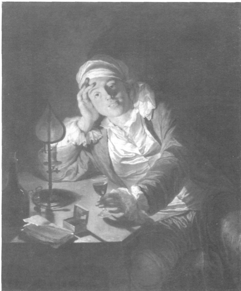
Figure 4. Anna Dorothea Therbusch, Un homme, le verre à la main, éclairé d'une bougie (Le Buveur). Paris, École nationale supérieure des beaux-arts.