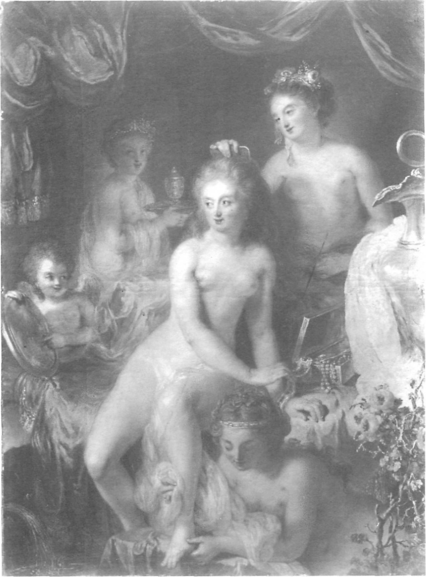
Figure 5. Anna Dorothea Therbusch, The Toilet of Venus. Potsdam, Neues Palais. Stiftung Preussische Schlösser und Gärten, Berlin-Brandenburg.