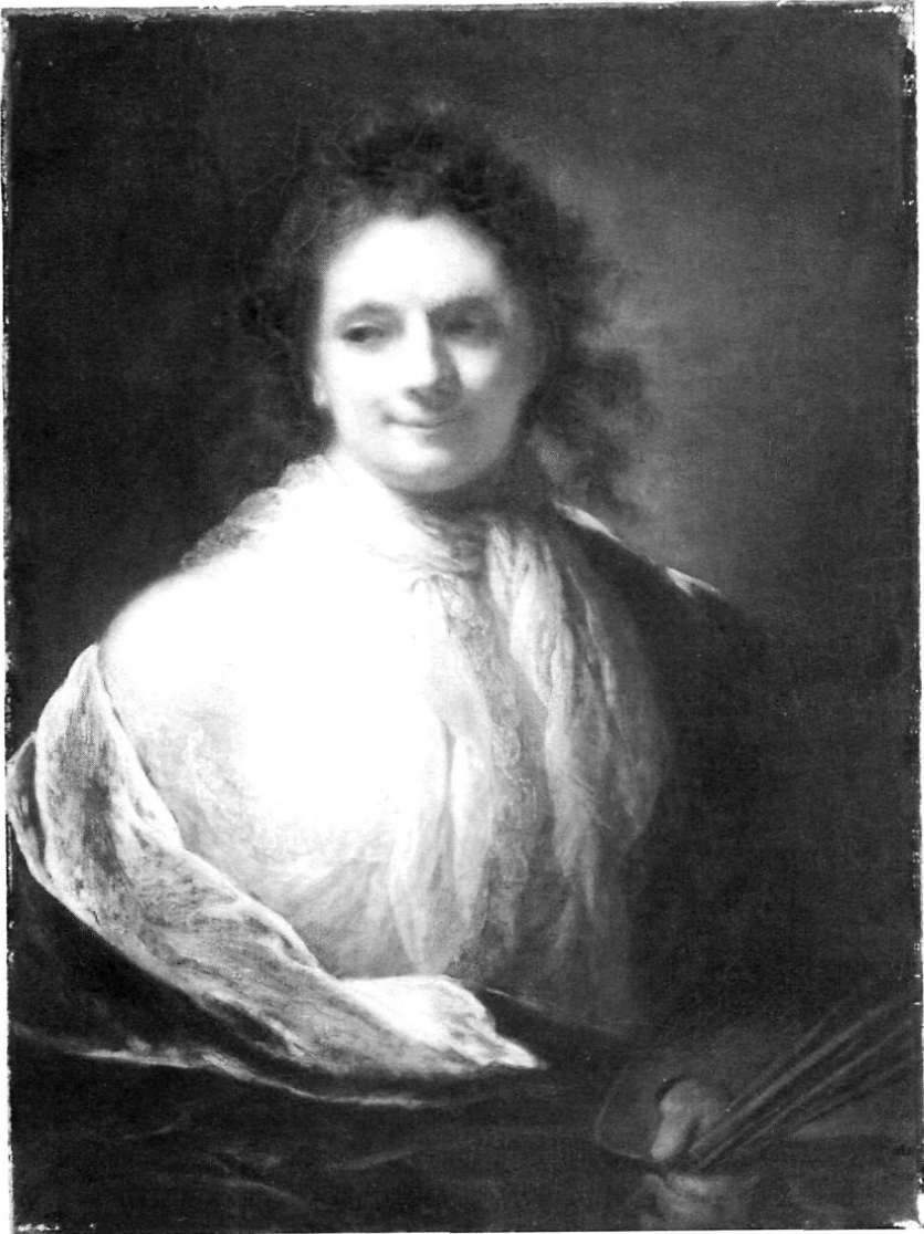
Figure 3. Anna Dorothea Therbusch, Self-Portrait. Stuttgart, Staatsgalerie