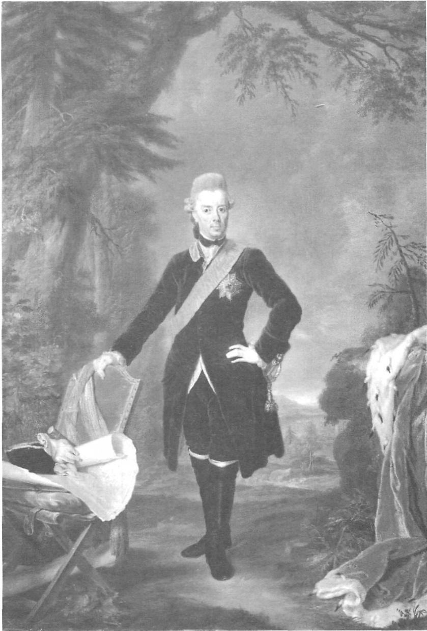
Figure 1. Anna Dorothea Therbusch, Prinz Henrich von Preußen. Potsdam, Neues Palais. Stiftung Preussische Schlösser und Gärten, Berlin-Brandenburg.