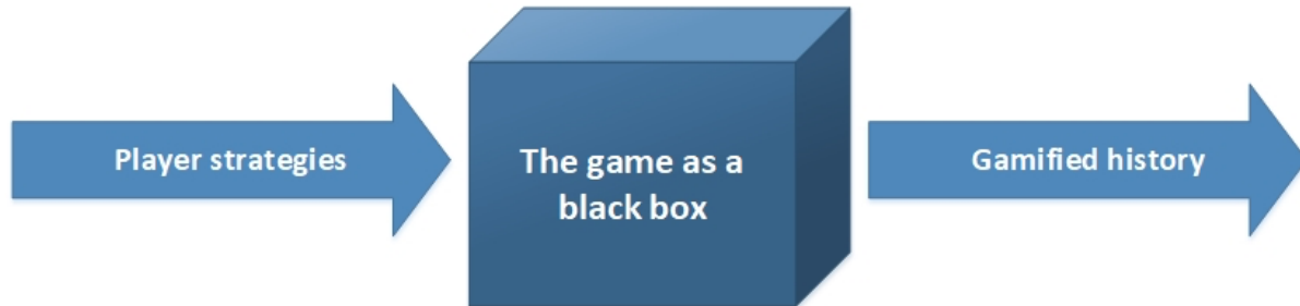
Figure 2. The game black box process.

roleplaying may choose to play and interact with the game as a black box. However, while this approach to EUIV can help the player focus on history, the extent to which they do so will always be dependent on how that player approaches the game. Thus, a black box approach to EUIV shifts the player's attention to engaging in historical roleplay and narratives rather than making choices to primarily maximise player benefits within the game's algorithm.