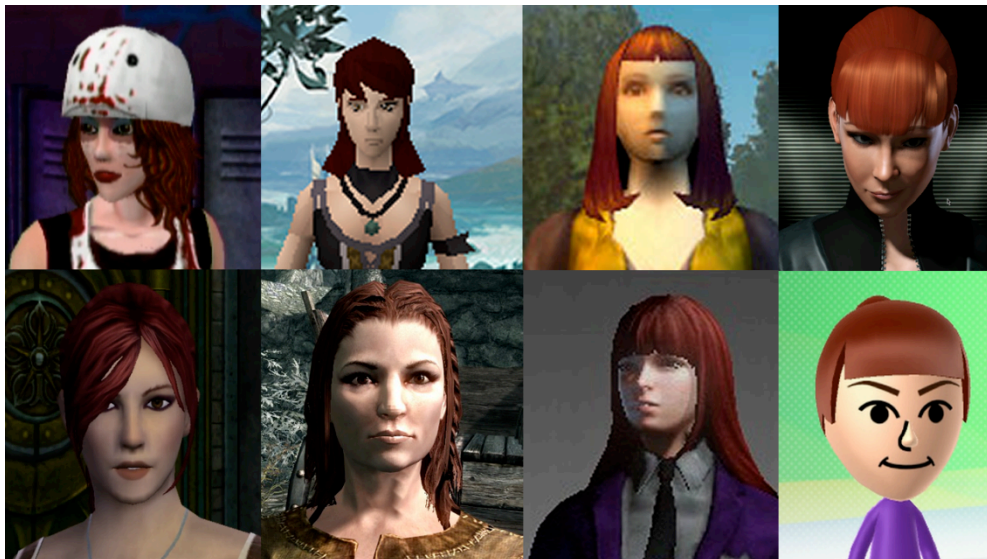
Figure 1: Eight avatars created in the micro-autoethnographic task.

Once I had completed preliminary notes and analyses on my past experiences playing and customizing avatars in each of the game spaces, I then proceeded to create a trans-ludic, representative avatar in each game: World of Warcraft , EVE Online , Saints Row IV , Jam City Rollergirls , Skyrim , RuneScape 3 , Rift , and the Mii Creator . Resultant avatars are shown in Figure 1. Subsequent video footage was then transcribed and analyzed for UI selection and manipulation events. In addition, a reflective narrative on the experience was also recorded by hand and included in the analysis.