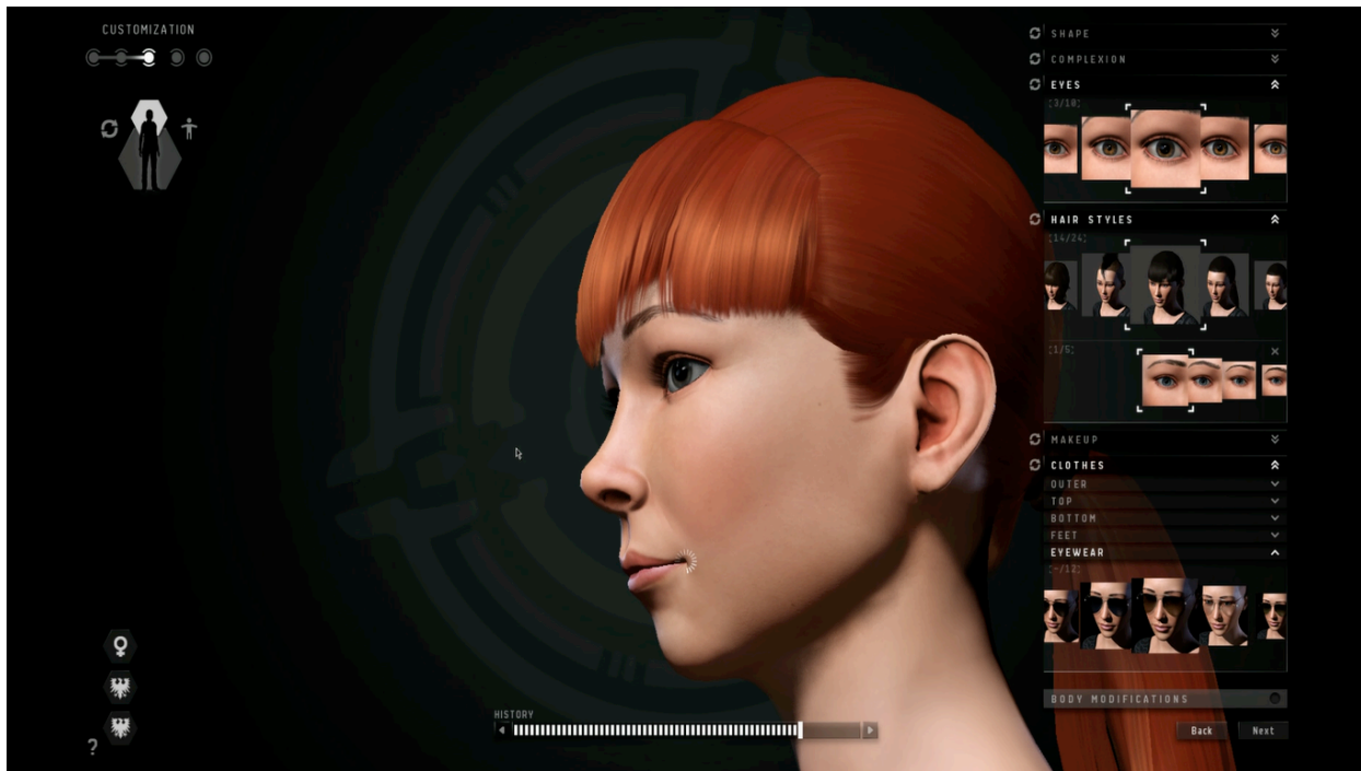
Figure 3: Creating my avatar in EVE Online.

Each interface was chosen due to my own familiarity and past experiences with these games. In all cases, I had spent a year or more playing with avatars in each of these ludic spaces. Notably, the interfaces vary with regard to complexity. For example, the Mii Creator and RuneScape 3 interfaces are both relatively low-fidelity affordances. In contrast, Saints Row IV , Skyrim , and EVE Online offer relatively high fidelity CCIs and produce more realistic looking avatars.