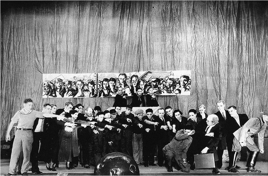
The jailing of CPC leaders stimulated the production of the play Eight Men Speak. This photograph was taken at the Standard Theatre in Toronto, 4 December 1933.