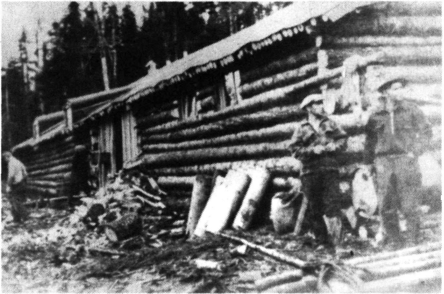
Loggers in a lumbercamp.