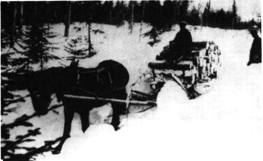
Hauling with a single team.

The...concession was arranged in order to help out lumbermen who will remain in the camps one month, and avoid their having to look for passes through the Relieving Officers and others if they are fortunate enough just to break square. It might help to make the men more contented and will keep them off the dole at any rate for a month if they will remain. 33