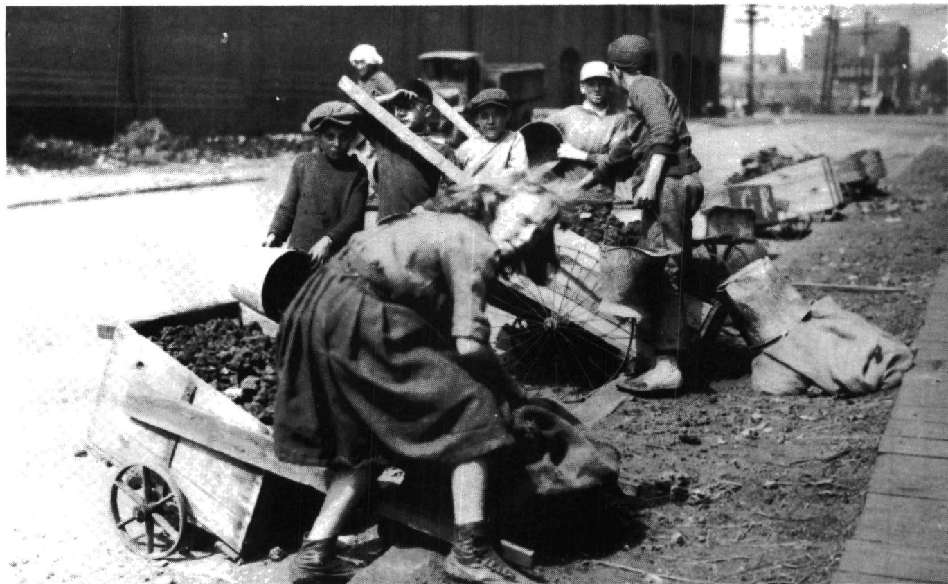
Toronto children picking over cinders, discarded by the Gas Company, for use as fuel: 31 August 1923.