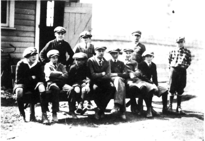
Waiting for work at a public golf-course 'caddy shack': Vancouver, April 1927.