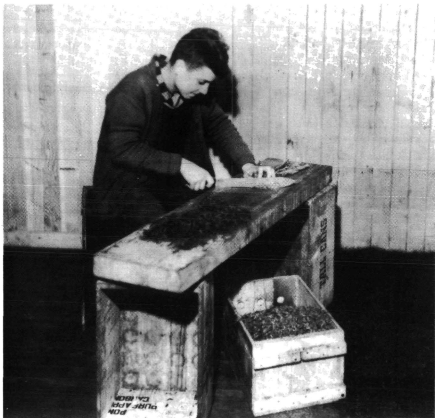
A youth - perhaps just old enough to leave school - cuts tobacco at the Jack Canuck Tobacco Company: Vancouver, September 1931.

full-time at housekeeping and child care. As a Cedar Cottage woman pointed out, "our life was very ordered. Mom stayed at home, Dad went to work, and kids did 'kids' things.'" In both classes, "kids' things" included attending school regularly. 13 As early as the end of World War I, middle-class families commonly expected children to complete junior matriculation at least. "There was," reported one woman, "a Kerrisdale tradition of a lot of high school graduates [and] about a quarter going on to university." In the 1920s, working-class families generally expected their children to complete their "entrance" examinations. Then, as they approached school-leaving age, they and their parents began the search for a job.