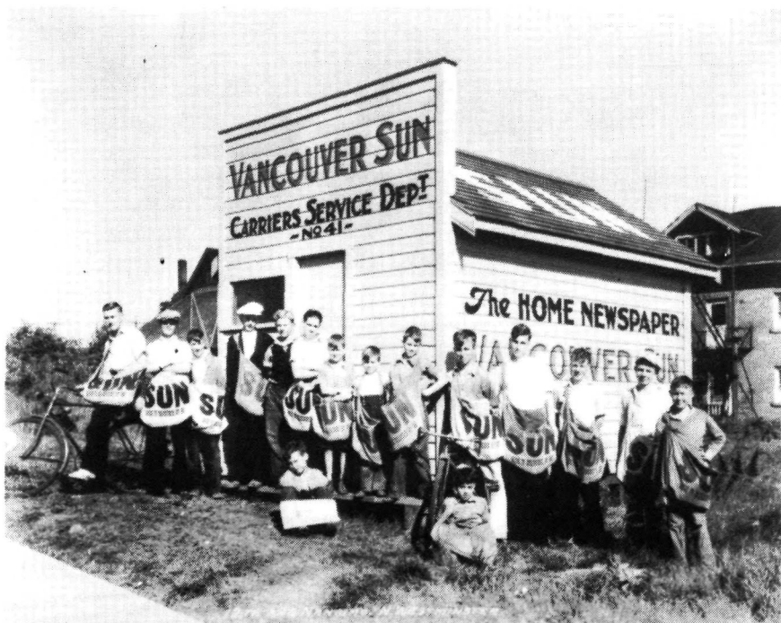
Carriers await their papers at a newspaper 'shack': New Westminster, 1933.

Newspaper routes ranged in size from about forty papers to just over a hundred. One boy "got up at 4:00 a.m. and had forty papers to deliver", another "had about 80 to 90"; a third "delivered in apartments, with approximately 100 subscribers." Most boys had to show the sub-manager that they had a bicycle with a large metal carrying basket or carrier before they could get a delivery route. In fine weather, boys found their task a pleasant one, with opportunities to chat with friends and customers. When it rained or snowed, however, they "wrapped their papers in brown waxed paper" and worked through their routes as quickly as possible, often returning home soaked to the skin.