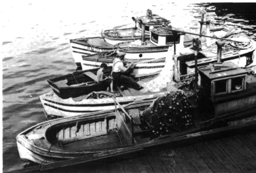
A boy helping to mend fishing nets.

cut the lawn." Postwar affluence gradually turned "taking out the garbage" into a real chore. Ever-proliferating forms of packaging, and the ever-thickening newspapers that were no longer needed to light stoves and furnaces, combined into enough waste-material to make wrapping and carrying out the daily garbage, and care of the area around garbage cans, into a regular chore, especially in middle-class homes.