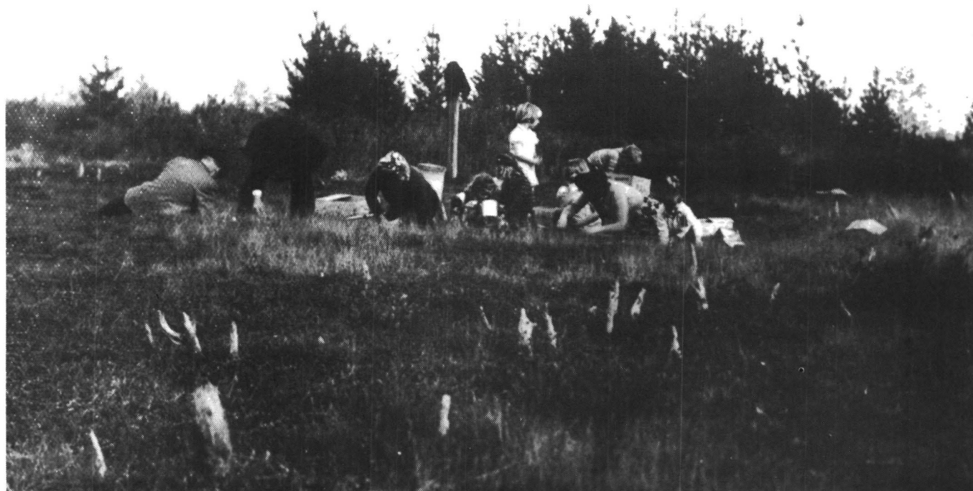
A family hand-picking cranberries at the Smith farm, Richmond, B.C.