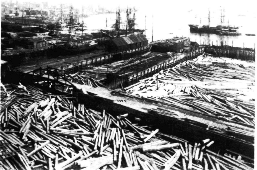
Photo is taken at the head of Saint John Harbour, probably in the 1880s. Two-, three-, and four-masted ships are receiving squared timber.

remained in the city to load square lumber and deals into the holds of scores of three-masted vessels, while others migrated to lumber camps in the interior. In the early 1800s, employers exercised untrammelled control over this labour market, generally paying the men between three and four shillings for 14- and 15-hour days. But common skills and experiences often knit lumber workers into a cohesive group unafraid to assert its rights. As early as 1835, Saint John sawyers joined forces to demand a wage increase. The pioneering effort by city longshoremen to seek a fairer distribution of the work occurred in 1849, when about 400 of them placed a large bell on the waterfront in an attempt to enforce the ten-hour day. During the 1860s, the port's 1,500 ship labourers regrouped as the Laborers' Benevolent Association (LBA) and pushed for a standard wage-rate. 28