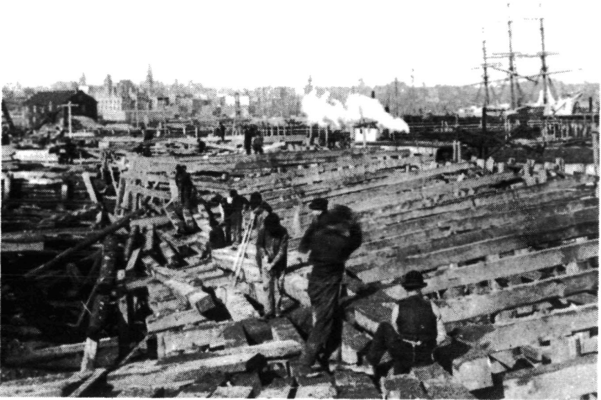
A few men engaged in the construction of a wharf rather than loading or unloading steamers at the Saint John waterfront. (New Brunswick Museum, Saint John, New Brunswick/Musée du Nouveau-Brunswick, Saint John, Nouveau-Brunswick.)

goods from sheds to the edge of the dock near the ship, while deck men prepared for the loading by rigging the ship's winches and gangplanks. Hold men worked below decks stowing or breaking out goods, moving them to or from open hatches, and loading or unloading slingloads. Winchmen, generally sailors until longshoremen had gained full control of the waterfront labour market, operated steam-driven, shipboard derricks that lifted or lowered the slings through the hatches. The hatch-tender, usually the gang boss, and the winchmen regulated the speed and shape of the work, while freighthandlers processed goods from dockside sheds to nearby railway spurs. 12