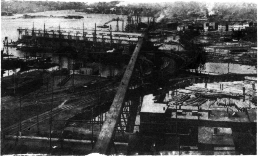
Photo is also taken from the head of the harbour but looks eastward toward the St. John River. In the foreground is the ICR dock with its prominent grain conveyors. Beyond the docks and railway spurs are ponds filled with deals. Trails of vapor from numerous worksites testify to the presence of steam-driven factories, mills, and vessels and help to date the photo to circa 1914.

Association told its foremen to cease this practice “except in cases of necessity.” 57 The next year, a Saint John stevedore firm entered into an agreement with one of the dual unions that was willing to negotiate work for one ship at a time rather than, like the Association, bargain for the entire season. And there were complaints that some day-gangs resumed work at night after labouring all day. 58