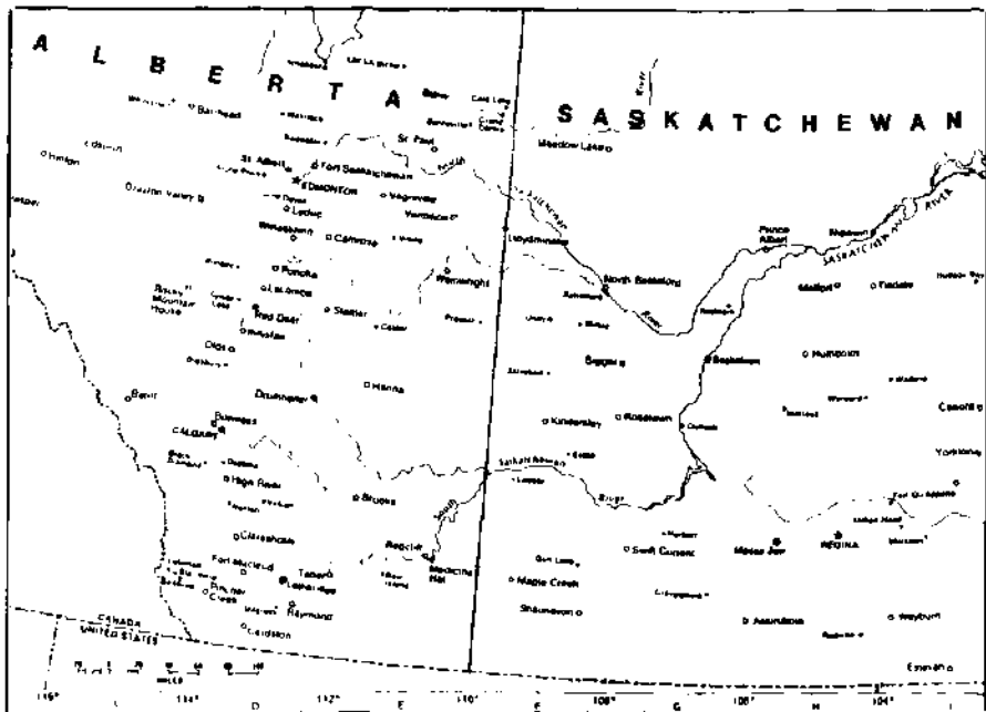
MAP 1 Alberta and Saskatchewan: Showing Points Referred to in the Text