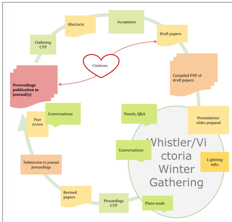
Figure 2: INKE scholarly communication cycle.

commitment to being more open and more social about this particular collection of scholarship, in this specific community.