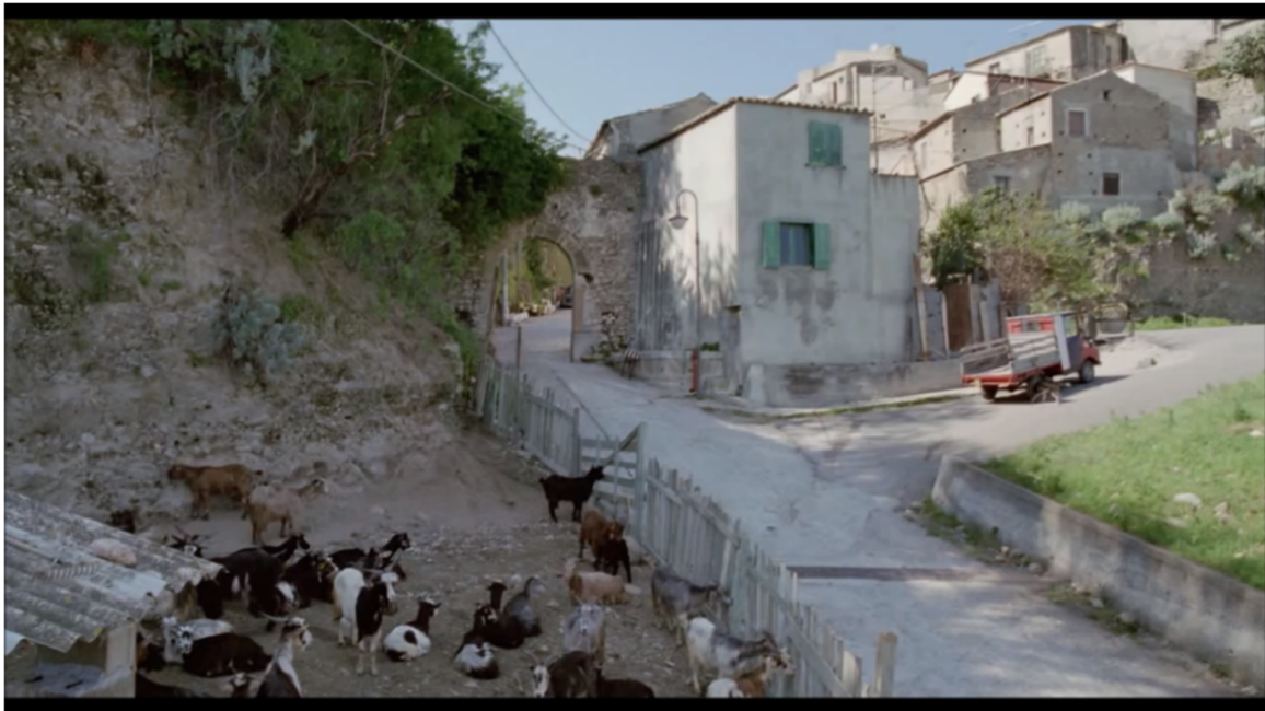
Figure 2: A still from Le quattro volte : the road outside the town gate.

The film repeatedly foregrounds the impossibility of containing the natural. We see the goatherd—effectively, the film’s only human character—collecting snails and placing them in a large pot: the goal, we infer, is to purge them until they are edible. A brick weighs down the lid to keep the snails from escaping. But when the man returns home, he finds the snails all over the kitchen table; he patiently collects them and puts them back in the pot. In a later scene, a long static shot displays the road winding off one of the town gates, with the goatherd’s house in front and the enclosure where the goats are kept on the left-hand side. A pickup truck is parked on an incline on the right (see Figure 2). In this scene, a particularly fractious herding dog unexpectedly removes the wheel chock that keeps the truck in place, so that the vehicle rolls backward, smashing into the fence and thus freeing the goats. The animals then flood the road and enter the goatherd’s apartment. One of them, standing on the kitchen table (see Figure 3), intentionally topples the pot with the captive snails.