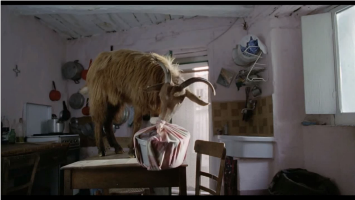
Figure 3 : Goat on table, from Le quattro volte .