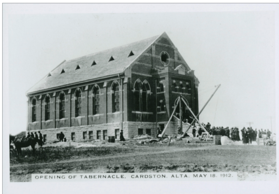
FIG. 2. THE CARDSTON TABERNACLE, 1912.

Card’s attitude toward the “land desolation” was transformed, rather, when he learned about a prophecy made by Joseph Smith in 1843 that the “nation of Great Britain . . . would never persecute the Saints as a nation” and that at