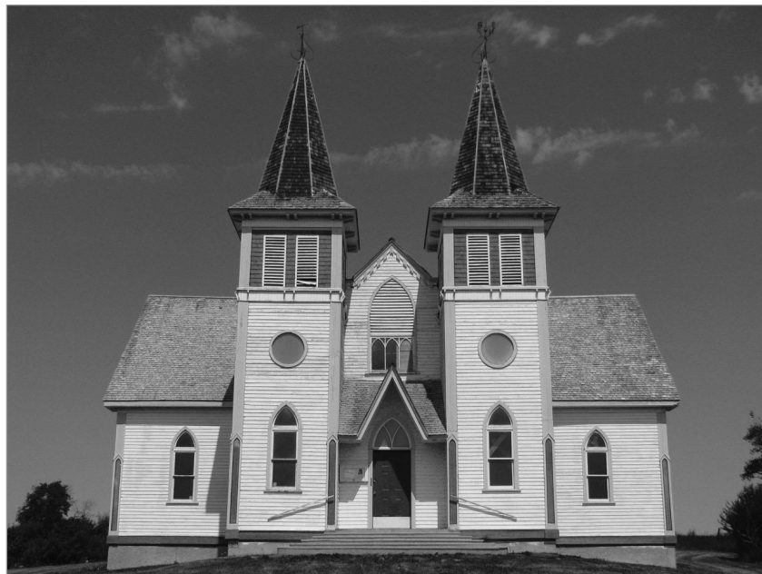
FIG. 10. VIEW OF THE WEST FAÇADE OF BEKEVAR PRESBYTERIAN CHURCH, BEKEVAR, RM 94, SK (1912). UNKNOWN ARCHITECT.

somewhat temporary. 24 It is therefore unusual to have overly large wooden churches in Saskatchewan, though there are some notable exceptions, such as Holy Trinity Anglican Church at Stanley Mission (1854-1860, fig. 8). However, Bekevar's committee was looking to compete with Kaposvar, and so needed to create something that was similarly arresting. They chose to accomplish this feat by adopting the features of a great medieval church.