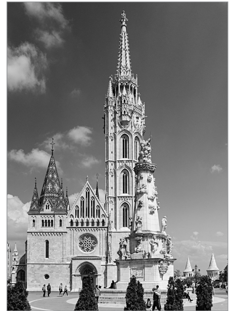
FIG. 4. VIEW OF THE WEST FAÇADE OF MATTHIAS CORONATION CHURCH, BUDAPEST, HUNGARY (14 TH CENTURY). | STEFAN SCHÄFER, LIC.

Evidence of the congregation’s involvement in the construction of the church is found in the particulars of the design of the façade, where links to the great churches of their native homeland are evident. The most likely source of inspiration was the great coronation Church of Our Lady (Matthias) in Budapest (fourteenth century, fig. 4). The general massing of the façade, with the northern tower being substantially lower than the southern one is quite similar, albeit simpler in design (figs. 1 and 4). It was common for churches to begin construction with the