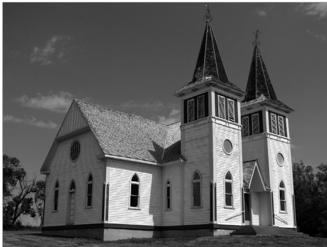
FIG. 2. VIEW OF THE WEST FAÇADE OF BEKEVAR PRESBYTERIAN CHURCH, BEKEVAR, RM 94, SK (1912). UNKNOWN ARCHITECT. | KRISTIE DUBÉ.