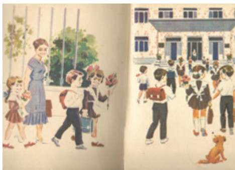
Armenian alphabet book Der-Krikoryan (1987, 1990), pp. 2-3