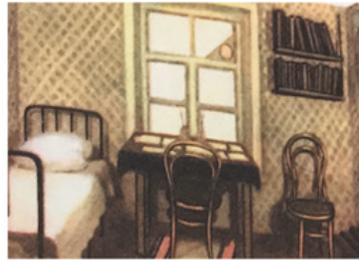
Figure 2. “In the Morning”: Volodya’s daily routine.