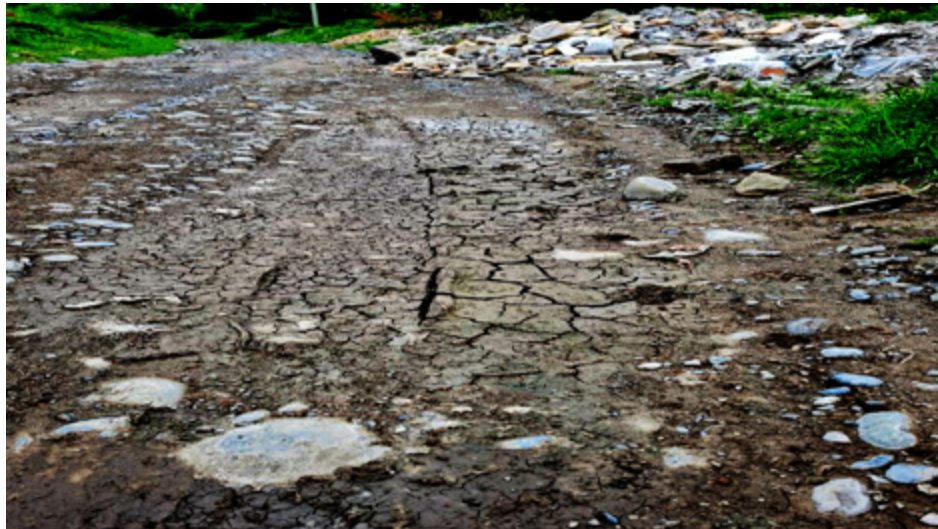
Figure 4. The pond 30 years after the Tavkombalas and the girls played there.

Although the edited story is only one of many possible edits, it helps us imagine how textbooks could be written (or edited) differently to open the timespaces for multiple temporal possibilities beyond the single trajectory of linear, chronological time. It also helps us imagine what might happen if textbooks continue to insist on a universal mastery of linear, chronological time, as if nothing else exists outside of it. In such a spacetime, children would have mastered the rigid schedules and straight timelines so well that they forgot to notice the pond and the Tavkombalas swimming in it. Over time, they would have also failed to notice how the pond was drying up and shrinking. And now, travel-hopping in time 30 years after the “Tavkombala” story, when children pass by the pond on their way to school, their experience is different. The pond is now empty. It has dried up, and there are no Tavkombalas there anymore. The girls do not walk silently along the pond in order not to wake up the fish in the mornings. They are no longer looking forward to playing with the Tavkombalas on the way back from school, and there are no Tavkombalas waiting for the girls to play with them in the afternoons either.