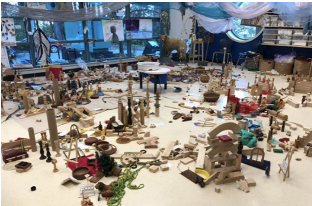
Figure 11. Interconnectedness.