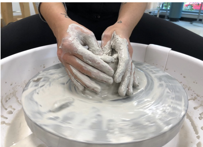
Figure 1. Clay entanglements.

intra-actively doing unto one another, reaffirming that we do not just come to know things but that knowing things is embedded deeply in relational connectivity with the world around us: onto-epistemology (Geerts et al., 2019; Lenz Taguchi, 2011). Through our entanglements, we came to understand the influence of the assemblage and how at-risk our encounters with clay were of being uprooted and disrupted. That is to say, it was precisely in the collision and the risk of disruption with clay that something new would emerge (Barad, 2007; Kind, 2010, 2017; Lenz Taguchi, 2011).