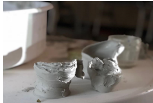
Figure 9. New possibilities waiting to emerge.

A fragile yet violent interweaving encircled the space-bodies-minds and led to a mindful sensitivity to the assemblages that presented themselves in the studio space.