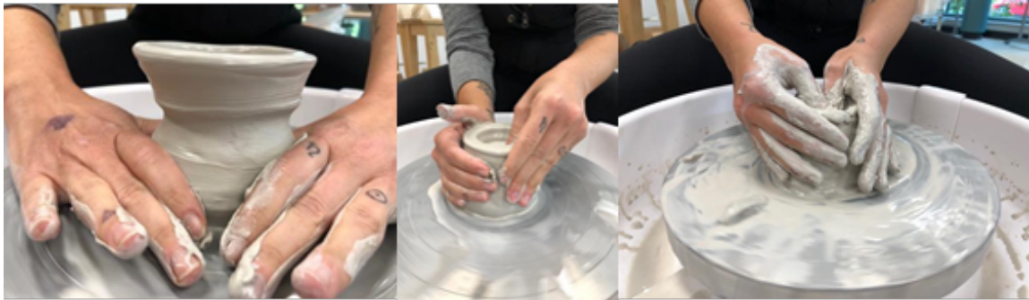
Figure 5. Entangling with clay.