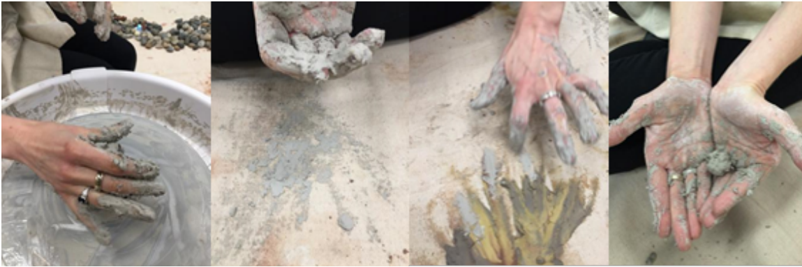
Figure 2. Being-with clay.

Many of our curiosities centered around the rhythms, intensities, and characteristics of clay as our hands joined with clay in the studio assemblages. We assumed clay did not require much movement, that it was sedentary and demanded a certain situatedness. Our presumptions of clay as a passive recipient of our ideas and notions regarding what clay could be or could do placed us in a hierarchy of “higher knowing” and positioned us as observers rather than in equanimity of being-with clay. Upon noticing this imbalance, attuned, we shifted out of an observer placement and into embodying a relational materialist approach. Through our embodied relationship with clay, we began to attune our bodies and minds toward clay’s being, and we learned more about clay’s needs. If kept hydrated, clay would feel soft and would generously repay us with ease of movement and a sense of relaxation. If its need for water were ignored, however, clay would start to harden, crumble, and separate with every movement of our hands. We learned how clay seeks to entangle with us, and as studious interlocutors we became more attuned to clay. Our encounter with clay elucidated the intra-activeness in-between our agency and clay’s agency. We noticed that the lines blurred from the place where our entities began and the place where clay’s entity ended. We were not separate but rather infused into a reliant and relational, reciprocal entanglement with one another.