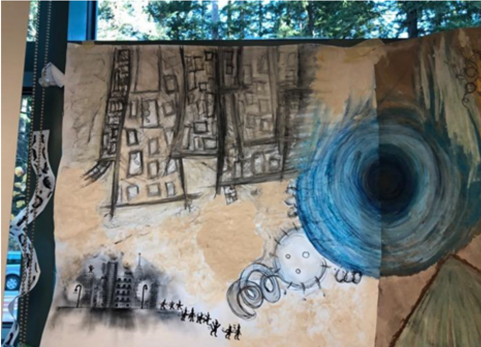
Figure 13. In the eye of the tornado.

The projection of a destructive tornado and the accompanying sounds, immersed in the middle of the destruction of blocks, we found ourselves wrapped up once again in an assemblage, creating an unsettling palpable feeling.