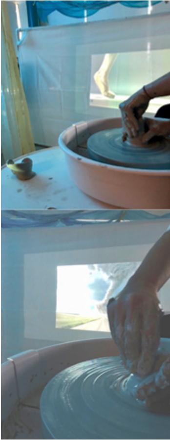
Figure 8. The juxtaposition of an elegant ballerina against the destructive tornado.