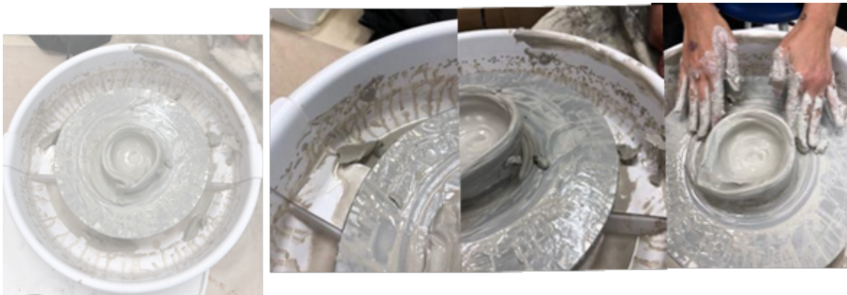
Figure 3. The pottery wheel.

We found ourselves standing in front of a pottery wheel that was hidden in the back of the studio. We stood there in collision with the pottery wheel and began to embrace the interconnectedness of how our feelings and senses