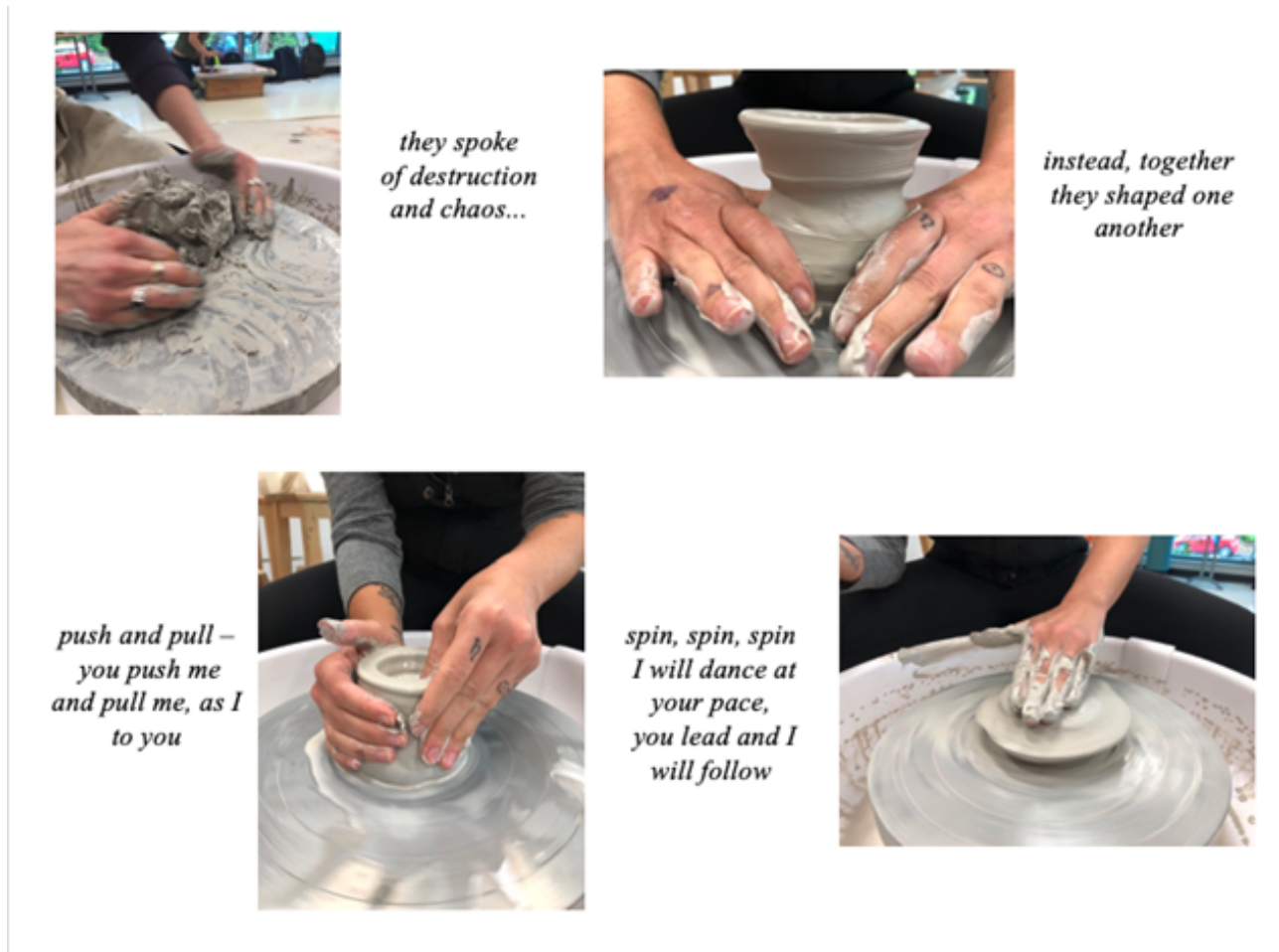
Figure 4. Poetry in motion.

contiguously induced our cognitions— bodyminds (Lenz Taguchi, 2011). What is this thing the pottery wheel? How does clay connect and live with the pottery wheel? How do we become relational with the pottery wheel and the clay? How will the pottery wheel and clay become relational with us? The pottery wheel's call to us was powerful; we could not resist it. As we came together with the pottery wheel and engaged with its force, we listened with relational materialist perspectives to guide us. We became open to finding the voice and the visibility of the material; we embraced the possibilities and moments of a diffracted onto-epistemology emerging (Lenz Taguchi, 2011). We knew this collision of elements would produce something new.