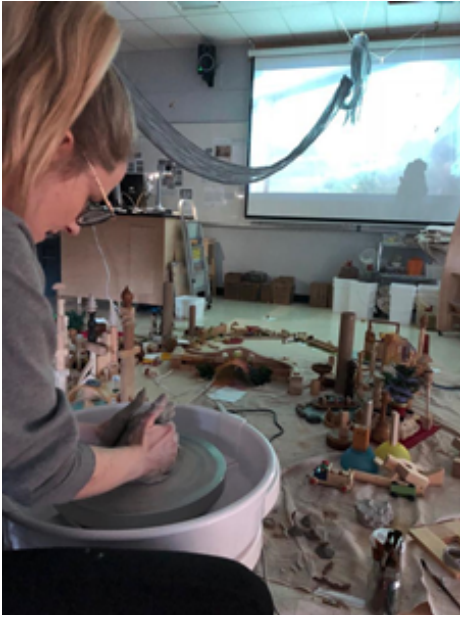
Figure 15. In the centre of the tornado's eye.

Consumed by the spiralling assemblages that emerged from our exploration and experimentation with clay, we were left with many more curiosities, wonderings, doubts, and speculations.