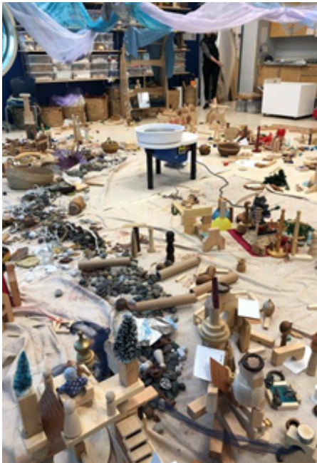
Figure 12. Studio.

The studio is never finished, never stopped, and never firmly in one place. The concept of things—animate and inanimate—sees them always in motion and always changing. What resembled a tornado took over our senses as we walked into the studio that day to continue with our clay inquiry. Though likely not purposefully positioned, a round circle shape stood out to us. Blocks were everywhere, some perfectly placed and standing and others randomly dispersed and scattered as if they had once been standing perfectly. Though it was still, again we felt movement while observing the room and walking around within the chaos. Liveliness was present. This observed assemblage brought back to our minds thoughts of tornados and spinning. The added element of destruction also came to our thoughts. We felt strongly encompassed by tornado in a bodily way.