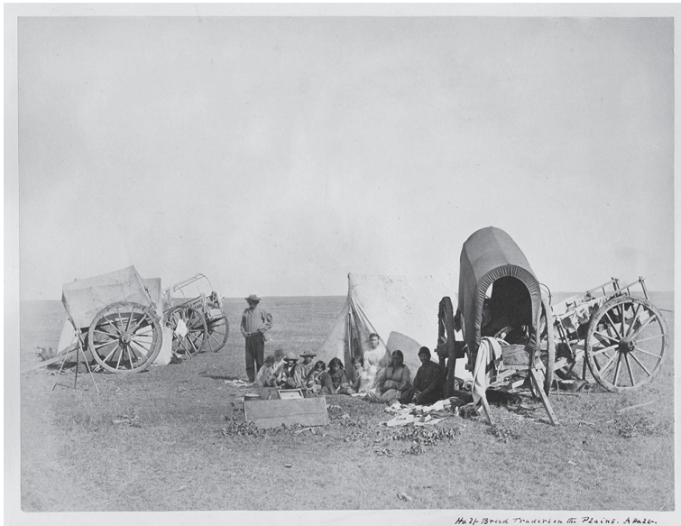
Figure 1: Half-Breed Traders on the Plains, 1872-73

perspectives over Indigenous-produced visual records. The images of mid-nineteenth-century Indigenous peoples that Canadians are most familiar with, for example, are paintings and photographs that were created by white male artists who visited the HBC territories in the 1820s through the 1850s. 40 According to artist and historian Sherry Farrell Racette, the Indigenous peoples in these images were “often coerced and uncomfortable subjects.” 41 The artists’ paintings and photographs share common themes about the wildness of the West and of its Indigenous inhabitants. Depictions of the Métis favour the buffalo hunt, Red River carts and freighting, and family groups (Figure 1). These images often reproduce stereotypes about Indigenous peoples and celebrate narratives of progress and nation-building.