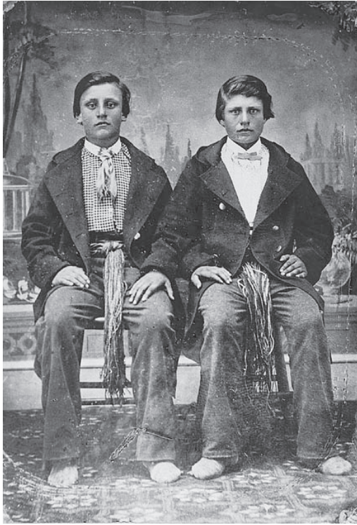
Figure 2: Joseph and Charles Riel, Winnipeg, 1871