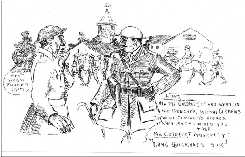
Private Cold feet

“Long quick one’s [sic] sir.” 52 To those not a part of the soldiers’ culture, anti-heroic actions, gallows humour, and biting satire were sometimes misconstrued as soldiers looking to abandon the war effort. Had the army been reduced to cowards? Had rot set in to the once proud fighting forces? While it might have been true for some soldiers close to succumbing to the stress of combat, most understood their role in the war and were not anxious to leave their mates in the lurch. Anti-heroes helped the soldiers deal with the strain engendered by the boredom, banality, and brutality of trench warfare. These cultural figures were also a reflection of inner anxieties and deep-set wishes, which were not always acted upon, but provided a vicarious outlet for many of the expressions and actions prevalent among most soldiers at the front. One should be wary of unifying themes in cultural history; the messiness and inconsistencies of conflicting issues need to be acknowledged and teased out. Soldiers could despise civilians one day and write pining letters to loved ones at home the next; they could turn their nose down at the “eye wash” emanating from ultra-patriotic papers and then turn to those same newspapers to understand what was happening at the front; they could be dodging shells one minute and then, after clearing the wreckage of a trench or helping a bloodied companion to the rear, return to collect the same shell bits as trophies or souvenirs. Heroes could be