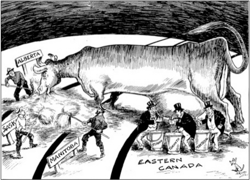
Arch Dale "The Milch Cow" ( Grain Growers' Guide 15 Dec. 1915, p. 6)