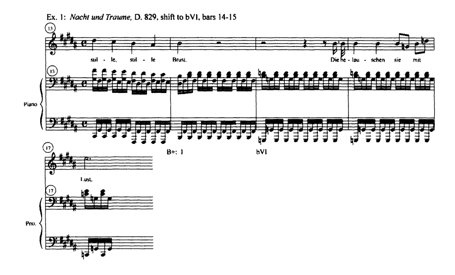
Example 1. Nacht und Traäume, D. 829, shift to bVI, bars 14-15

Musically Schubert has conveyed this involuntary quality by a sudden turn to the flat submediant chord, G major, in bars 14 to 15 (example 1). There is no logical preparation of this event through G's applied dominant, merely a direct slip from the B-major to G-major chord. This completely unexpected move creates the sensation of being absorbed into an interior dream-world at that point in the poem where the dreamer pays rapt attention to the dream ("Die belauschen sie mit lust" [They observe them with delight]). Once G is reached, the music remains suspended in a tonally ambiguous space, occupied only by G major and its subdominant C major (bars 15-19). The otherworldly effect of the harmonic shift supports Susan McClary's contention that the early Romantics often imbued the flat submediant region with a dream-like atmosphere (McClary, 1983). This feeling is reinforced by the harmonic stillness of the prolongation of the G major chord, where for five bars the music focuses intensely on one harmony, elaborated solely by its own subdominant. While the framing passages in B major capture the calm of the night, they are still animated by harmonic movement. This movement virtually ceases in the central G major episode thus creating the effect of being lost in inner contemplation.