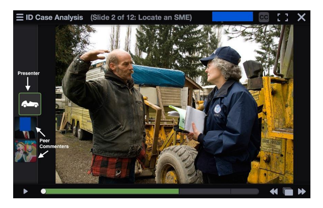
Figure 1. An example of role-playing peer-feedback activity on VoiceThread.