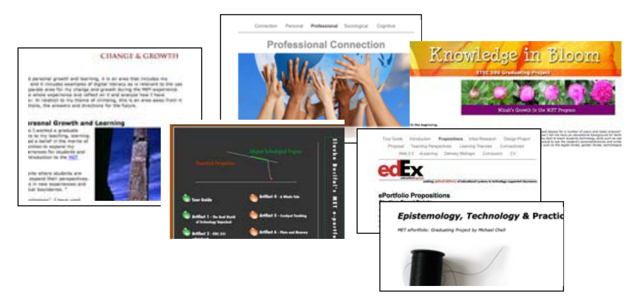
Figure 2. A collage of ePortfolios from Summer 2007

A different way in which the metaphors and hyperlinks were connected was demonstrated in DB's ePortfolio. He used visual tools (and the sidebar) to introduce each section. All those visuals and tools linked well to the overarching metaphor of learning as making choices of the appropriate tools within a workshop.