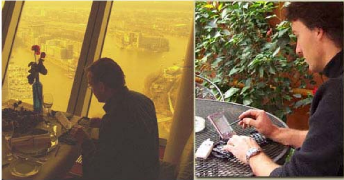
Figure 2. The picture on the left shows a tutor 'on the move,' writing and sending emails to his students from Düsseldorf 'Himmelturm.' The next picture is of a student on holiday communicating from the garden of his hotel in Rome.