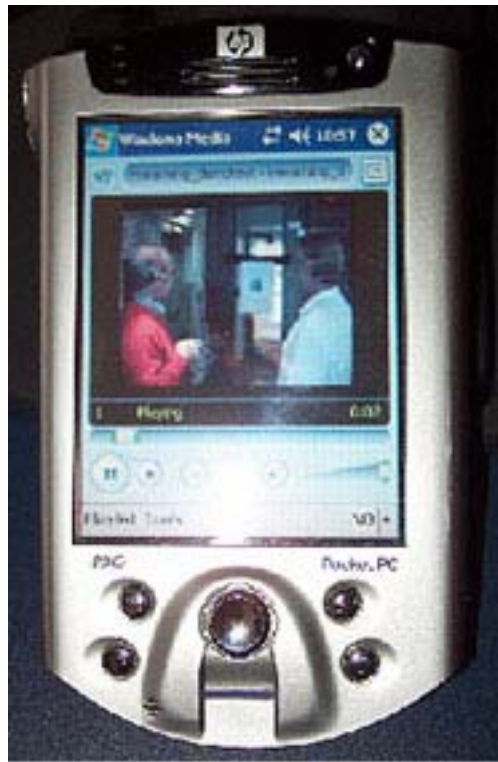
Figure 5. Video on the PDA