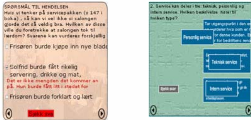
Figure 4. Screen shots from the PDA of multi-media multiple-choice question and 'drag-and-drop' assignment.

It was clear during internal testing that the solutions functioned according to expectations; they allowed all students in the course, irrespective if they were mobile or tied to a desktop computer, to participate and communicate in the same course. However, because additional materials had to be developed specifically for the mobile learners, we found that these solutions could never be applied cost-effectively on a large scale.