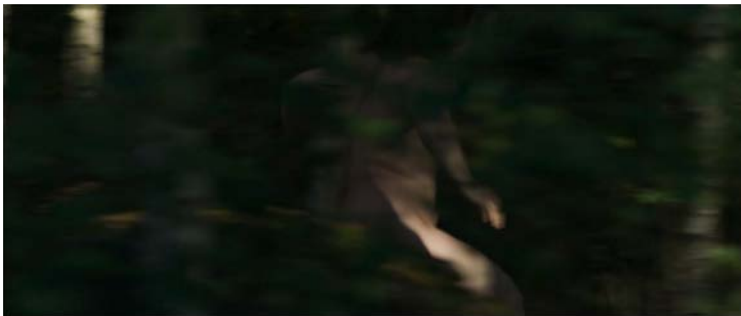
Figure 5: Haptic cinema: Tina's ek-static wilding. Border (Gräns) (2018). Directed by Ali Abbasi, cinematography by Nadim Carlsen.

It is necessary to return to the question of matter as mater , that is, as mother, matrix, or womb. Throughout the film, vivophilia (Behar), that is, its "configuration of matter as a site of generation or origi-