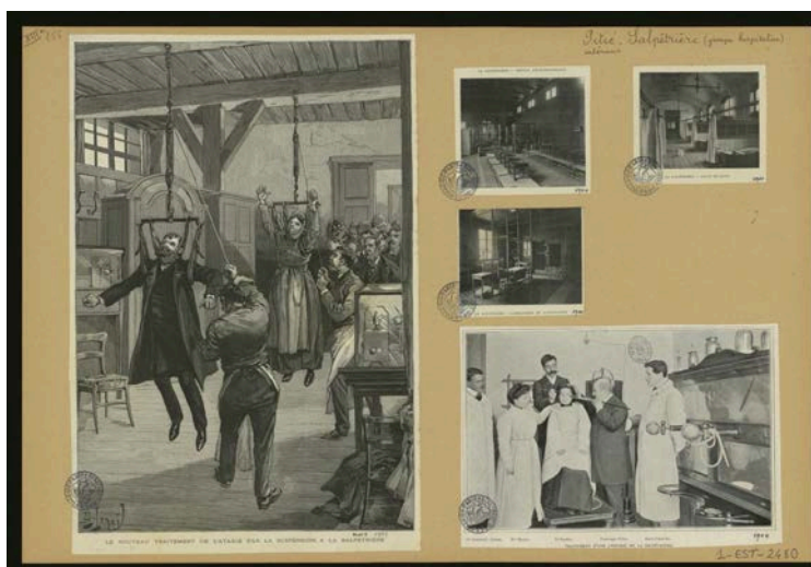
Figure 2: Paris, centre hospitalier universitaire Pitié-Salpêtrière, intérieur.