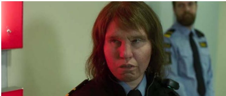
Figure 1: Tina's (Eva Melander) stunned affect. Border (Gräns) (2018). Directed by Ali Abbasi, cinematography by Nadim Carlsen.