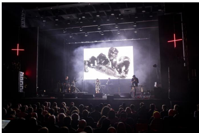
Fig. 1. Tanya Tagaq, Nanook of the North at the Dark Mofo Festival, June 8, 2018.

embodiment—gesture, breath, memory, and movement—modulates media as a dynamic form. I explore this dynamic form as chronic collage , through two recent works of media reperformance: Tanya Tagaq's Nanook of the North (2012–) and Guy Maddin, Evan Johnson, and Galen Johnson's The Green Fog (2017), 4 as compositions of time, part of the enduring ephemeral relation of festivals to archival practices.