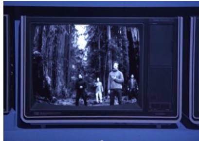
Fig. 7 and 8. Photographs of The Green Fog (Guy Maddin, Evan Johnson, and Galen Johnson, 2017).