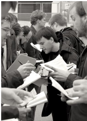
Fig. 6: Key signing party as FOSDEM 2008.

The ritual and affective dimensions of encryption are often overlooked in frameworks that emphasize its technical aspects. Among hackers, the signing of digital keys to communicate by email with PGP—an activity that confirms you are a trusted person within an encryption web of trust—has become a ritualized event. During hacker meetings, it is not rare to have “key signing parties” where all who want to attend will sign their public key face-to-face. Assembled in circles or in lines, participants (often white men) one by one recite out loud their public key—a long string of numbers—and thereby confirm that they are the ones behind their public key. In some cases, ID documents provide visual proof of identity. At this point, no digital media is involved: speech, pen, and paper are the sole accepted means of information transmission. It is through this process that members of an encryption network become fully trusted interlocutors since the authentication of their key was done face-to-face. This exercise can take a few hours depending on the number of participants. Once members have gone through this ritual, they become part of the web of the fully trusted.