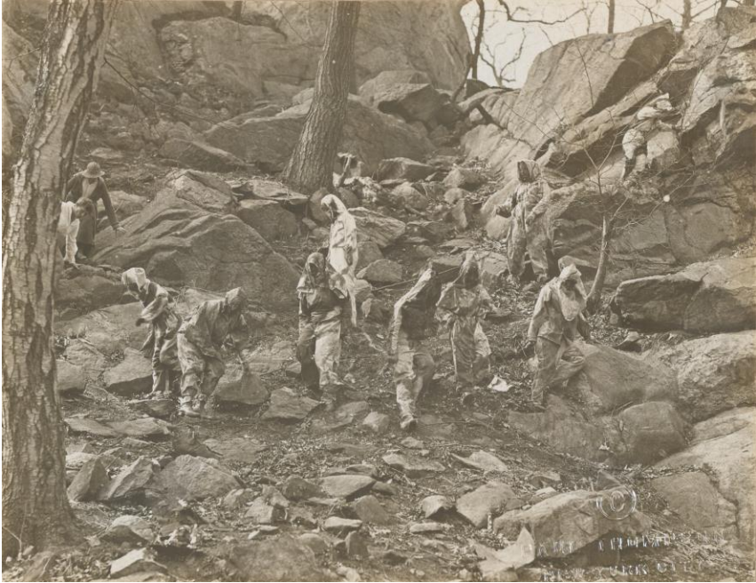
Fig. 2. Women's Camouflage Reserve Corps, of the National League for Women's Service, study camouflage at Van Cortlandt Park, New York, 2018.