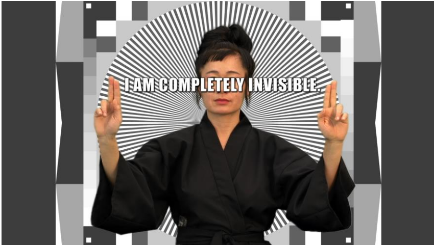
Fig. 1: Still from the film How Not to Be Seen: A Fucking Didactic Educational .MOV File , Ito Steyerl, 2013. HD video, single screen in architectural environment, 15 min 52 sec.