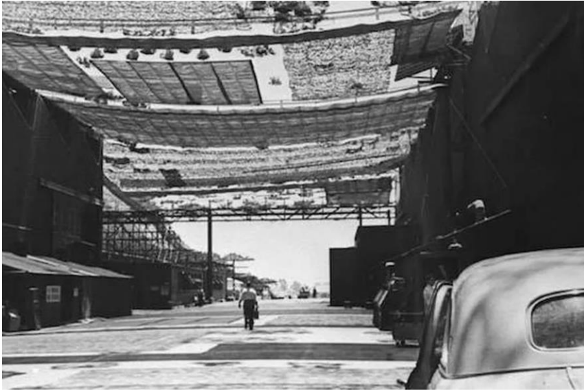
Fig. 4: Douglas employee walks underneath the camouflage designed by landscape architect Edward Huntsman-Trout to conceal the manufacture of military aircraft at the Douglas Aircraft Company Santa Monica plant during World War II. 1941–1945.

technological surveillance. 13 Digital surveillance seems to have replaced the atomic bomb as the utmost invisible and ubiquitous threat in the collective imagination.