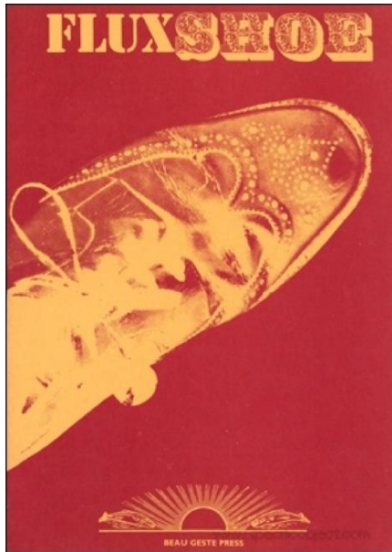
Fig. 1. Felipe Ehrenberg, cover of FLUXshoe , 1971, 29 x 21 cm., Devon: Beau Geste Press, 144 pp., unsigned and unnumbered.

But back to Ehrenberg. Besides his engagement in editorial projects, as an artist, he was highly influenced by conceptual and experimental art, exploring graphic design, painting, photography, collage, sculpture, and installations, but also creating book objects, such as the Codex Aeroscriptus Ehrebergensis (1990) (see Fig. 4), as well as performance and sound poetry. Maneje con precaución [ Drive with Caution ] (1973) is probably his only known “sound poem,” also defined by him as the longest visual poem by ekphrasis. This piece was recorded during a car ride on Calzada Ignacio Zaragoza, one of Mexico City’s most active and popular downtown avenues, where he sees all sorts of posters and signs on the street that he attempts to read as if reading the urban landscape through description while speaking with the window open, thus allowing for the murmuring soundscape of traffic to become part of the recording and of the piece itself. 21