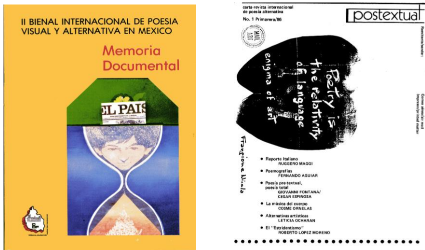
Fig. 2. Cover of the catalogue of the II International Biennial of Visual and Experimental Poetry, October 1987, México City: Departamento del Distrito Federal 56 pp.