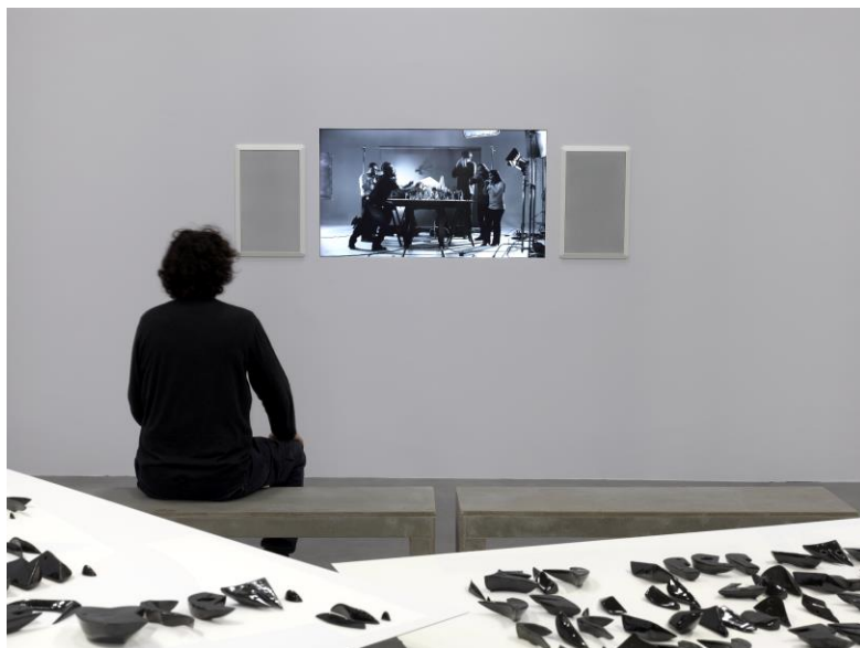
Fig. 5-6. Carlos Amoraes, La vida en los pliegues [ Life in the Folds ], 2017, series of 92 photocopies on metal, 7 folding tables with metal bases and silkscreened Alucobond panels, 924 ceramic ocarinas; 1 video, 13', edition 1/5. Installation created by the artist for the Mexican Pavilion at the 57th Venice Biennale. Colección Instituto Nacional de Bellas Artes y Literatura (INBA) Image courtesy of kurimanzutto and Estudio Amoraes. Photo by Dario Lasagni. Reproduced with the kind permission of Carlos Amoraes.