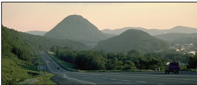
The erosional remnants of an Early Devonian volcanic pipe from the Tobique-Chaleur Bay Belt, Sugarloaf Mountain, Campbelton, New Brunswick.

the Earth began cooling, leading into Chapter 8, Into the Quaternary Ice Age . In addition to the effects of the Ice Age on landscapes and life forms, another factor to consider is the rise and fall of sea level and our changing coastlines. The earliest humans arrived about 12,500 to 9500 years ago, and left behind several important archeological sites, mainly along waterways. Box 9: Between Land and Sea describes the ever-changing coastline, including the significant environmental role of coastal marshes, and how humans are affected by and play a role in causing erosion and altering the coastlines.