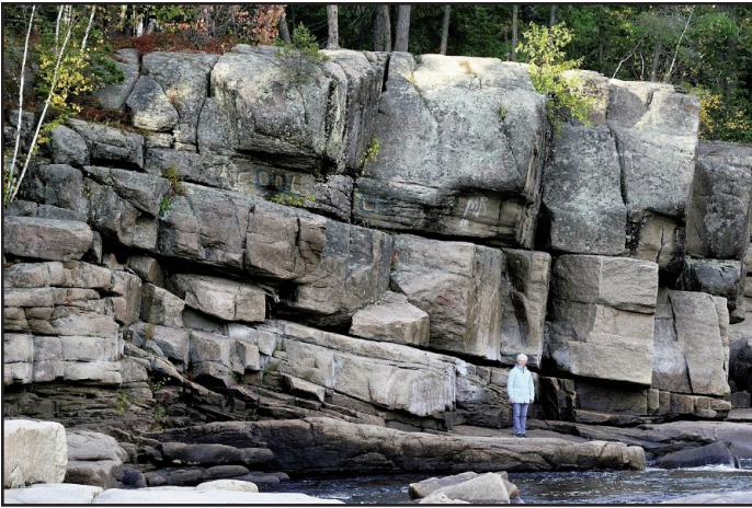
Typical subhorizontal joints (prominent fractures) in granite at Pabineau Falls, New Brunswick, caused by release of pressure over time as overlying rocks were removed by erosion.