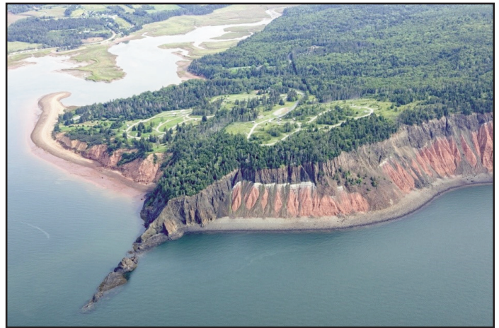
Aerial view of the cliffs at Five Islands Provincial Park, Nova Scotia, showing a faulted block of Late Triassic North Mountain Basalt (dark grey), Early Jurassic fluvial and lacustrine red sedimentary rocks (left of the faulted block) and Late Triassic lacustrine red sedimentary rocks (right of the faulted block) overlain by North Mountain Basalt.

Pokiok Batholith in New Brunswick. Box 6: Fish Tales goes through the evolution and classifications of fishes, linking certain specimens to various Maritime localities. Chapter Six, Basins and Ranges , describes the development of the coal fields, from the changing seas and climate – producing a great “drying off” (creating the red soils of Prince Edward Island for example) to the greatest known extinction of approximately 90% of all living organisms. Box 7: Old Salt and Lime relates to the impacts of these times of great aridity, while Box 8: Flowing Through Time describes the effects of fluvial environments on both landforms and organisms, including human habitation impacts. Chapter Seven, An Ocean is Born , shows how the North Atlantic Ocean grew over time during the breakup of Pangea, and makes connections to the Mesozoic to Cenozoic rocks formed across the region. Some of the basalt flows that heralded the birth of the Atlantic Ocean contain many types of zeolites, and the Bay of Fundy is a world-famous site for collecting these minerals. Several extinction events took place during these times and the extraordinary fossil evidence for one of them is found in several key locations in the Maritimes, especially the “Fundy Fossils” section. During the Cenozoic,