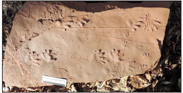
Trackway of a Permian tetrapod (a four-legged animal) on a sandstone block discovered in Lord Selkirk Provincial Park, Prince Edward Island, dating from about 290 million years ago.

The puzzle pieces of the geological stories are pulled together starting in Chapter 4, Into Deepest Time . The processes involved in producing the first land masses, to the first life forms and banded iron formations, build on previously explained concepts. The growth and demise of supercontinents to microcontinents, along with changing oceans are framed within the rock formations of the Maritime Provinces over time, with many local examples given. Box 4: Rock Stars illustrates the key discoveries and life stories of several prominent individuals who made exceptionally noteworthy contributions to Maritime geology and geoscience education. Chapter Five, The Pieces Come Together , further explores the significant tectonic, climatic, and biotic changes from the Proterozoic and Cambrian to the Devonian, setting the stage for the introduction of the Carboniferous – a particularly rich period of the ancient Maritimes. Box 5: Granite is an analysis of the granite batholiths and related features found as distinct landforms, such as the South Mountain Batholith in Nova Scotia, and the