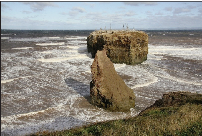
Sea stacks formed from Carboniferous sedimentary rocks under attack from stormy weather, Pokeshaw, New Brunswick.

growth rings of Devonian corals indicating that the length of a day was then only 22 hours long!