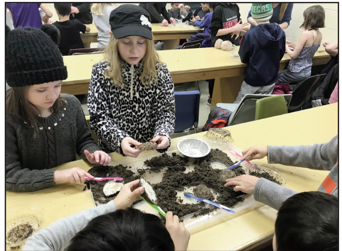
Figure 3. Students carefully using toothbrushes to uncover their fossil casts.

Meteorite Impact Lesson: Students were given a quick (~ 5 min) presentation on meteorites and meteorite impacts. Dr. Mel Stauffer kindly loaned meteorite specimens from his collection to use for the outreach program, including iron meteorites (the Toluca, Campo del Cielo, and Canyon Diablo meteorites) and a stone meteorite. These samples were carefully passed around under supervision by volunteers for 5–10 minutes. While samples were passed around, one volunteer set up the hands-on experiment, which demonstrates how a meteorite impact occurs. The volunteer used a clear plastic container and poured a layer of flour (~ 3 cm thick), and sifted a thin layer of cocoa powder (~ 2 cm thick) on top. Next, a student volunteer was asked to throw a small rubber ball at the cocoa powder in the container creating an impact crater (Fig. 4a). Students used their observational skills to draw the crater’s shape and discussed what factors could change it. Finally, a new volunteer threw the ball with a change in the angle, height, or speed (Fig. 4b).