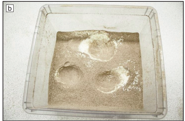
Figure 4. Meteorite impact structure(s) resulting from a rubber ball toss (a) and tosses thrown from varying angles and velocities (b).