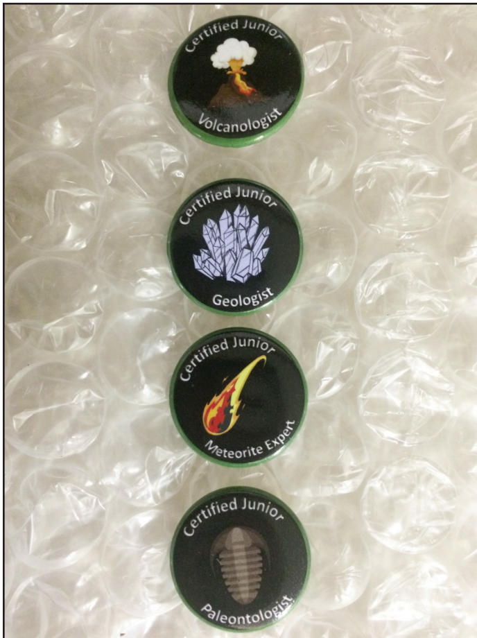
Figure 7. Badges distributed to students who completed our ‘Rocks and Minerals’, ‘Fossils’, ‘Volcanoes’, and ‘Meteorite Impact’ lessons.

‘Rocks and Minerals’ activity. Based on their answers, the percentages of students who enjoyed particular components most were as follows: 50% of students enjoyed the museum tour, 30% liked looking at samples under the microscope, 10% enjoyed looking at rock and mineral hand samples, whereas 5% enjoyed the mineral matching activity and 5% couldn’t decide and enjoyed everything. When asked what they learned, here are some typical responses: