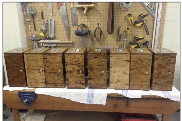
Figure 1. Transport cases for petrographic microscopes used for remote outreach activities.

Various methods have been proposed for communicating in outreach settings including the three prominent models for science communication (deficit, dialogue, and participation models; Metcalfe 2019). Among many issues (e.g. it assumes supremacy of western knowledge) the deficit model utilizes a one-way, top-down transmission of information from the presenter (expert) to the audience (layperson). This assumes that by audiences gaining more knowledge, they will inevitably have a positive attitude towards the topic (Reincke et al. 2020). The dialogue model is a form of two-way communication involving a transfer of information between presenter and layperson and vice-versa. It builds on mutual respect, encourages listening and learning, with the audience as a helpful resource and the expert as the facilitator (Reincke et al. 2020). Lastly, the par-