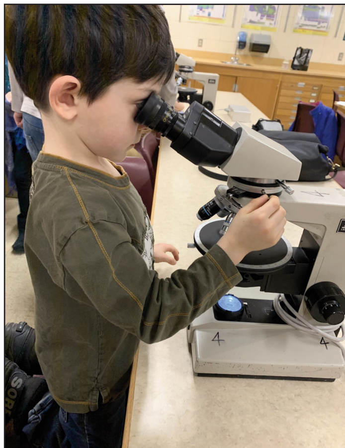
Figure 2. Homeschool student observing minerals under a petrographic microscope.

Following this activity, we looked at minerals under a microscope. Before starting, to ensure that the students handled the microscopes carefully, presenters told students that each microscope was worth $1,000,000; this exaggeration was justified in emphasizing that students should use extra caution! This was the student's first time seeing rocks under a microscope (Fig. 2), so no advanced observations were made. Instead, a volunteer switched between cross-polarized and plane-polarized light and sometimes inserted the gypsum plate, to get students' attention!