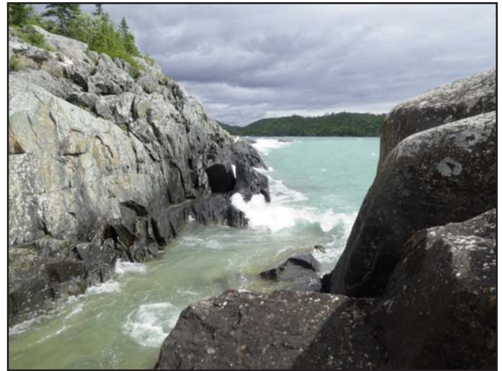
Pukaskwa dyke (~1106 Ma) intruded along plane of weakness in deformed Archean pillow basalt (in left cliff face).

This field trip will focus on ca. 1140–1105 Ma volcanic and intrusive rocks related to the Early Midcontinent Rift, emplaced onto or into the Archean terrane northeast of Lake Superior. Because we are virtual, we can visit many of the best outcrop exposures located off the beaten path, from the spectacular Lake Superior shoreline to as far east as Timmins. We will look at a very diverse range of alkaline and tholeiitic igneous rocks with planned stops at: 1) Chippewa Falls and Mamainse Point to see pahoehoe lava flows and interflow conglomerates, 2) Rift perpendicular dykes including the Great Abitibi and Kipling dykes, 3) Rift parallel alkaline dykes in Pukaskwa National Park, 4) interlayered alkaline and tholeiitic basalt at Penn Lake, 5) the Coldwell Complex, the largest alkaline intrusion in North America, to see partial melting at the Archean footwall contact and classic intrusive relationships between nepheline syenite and alkaline gabbro at Neys Provincial Park, and 7) Pebble beach in Marathon. We will finish the field trip by examining some of the highly unusual but distinguishing igneous textures at two of the best-known copper-palladium deposits located in the eastern Midcontinent Rift, i.e. the Geordie Lake and Marathon deposits within the Coldwell Complex.