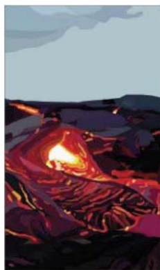
Tectonic Processes & Geohazards