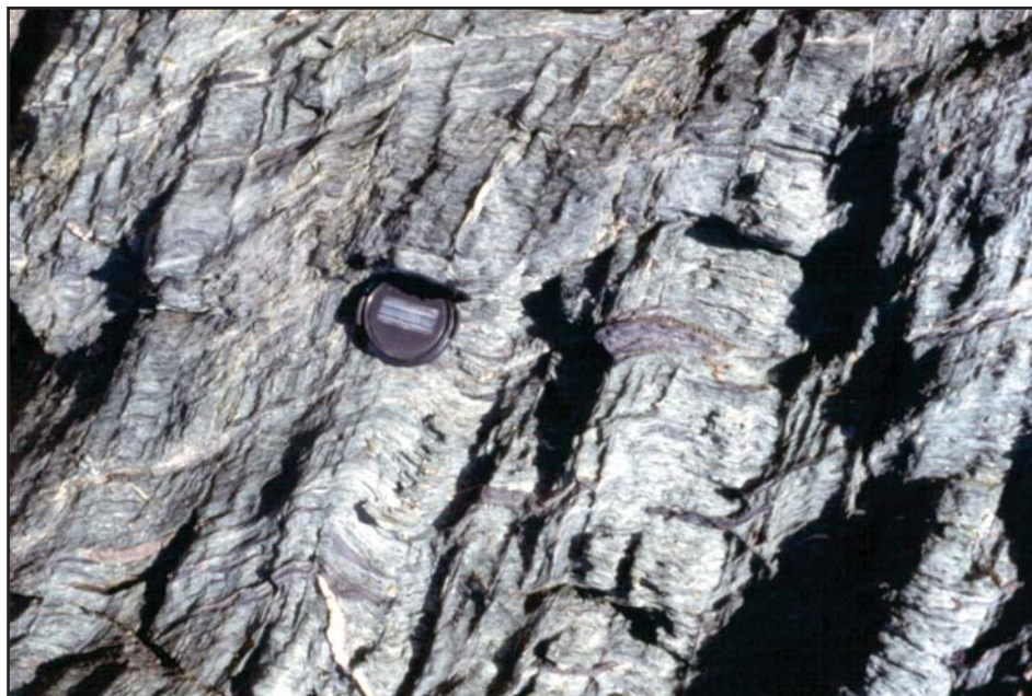
Figure 1. Schistose mafic volcanic tuff of the Neoproterozoic Ingalls Head Formation.

This two day, post-conference field trip will visit shoreline exposures on the scenic Island of Grand Manan, located in the Bay of Fundy off the south-western coast of New Brunswick. Grand Manan is unique in Atlantic Canada in displaying the geological features of both the ancient Gondwanan margin of the Paleozoic Iapetus Ocean and the Mesozoic margin of the modern Atlantic Ocean. The eastern part of Grand Manan is underlain by complexly deformed sequences of volcanic (Fig. 1) and sedimentary rocks (Figs. 2, 3), the ages of which have only recently been determined by geochronological analyses. This field trip will examine