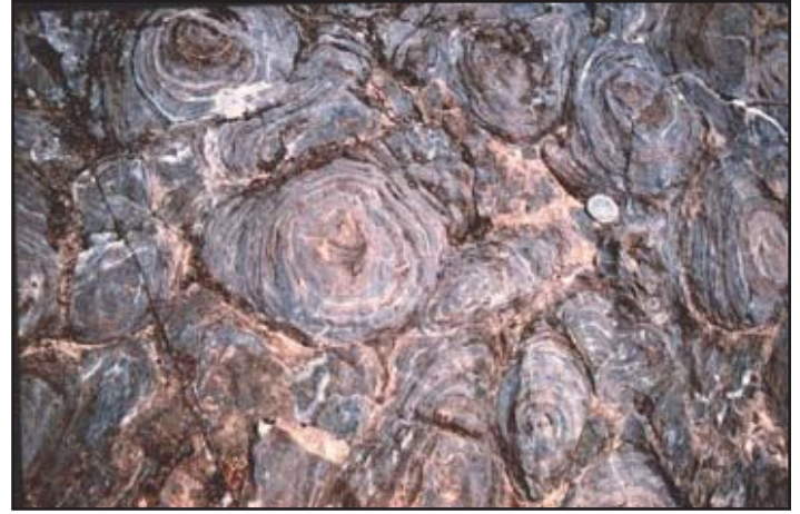
Figure 3. Outcrop of the stromatolite Archaeozoon acadense in the Green Head Group on Green Head Island.

Although some aspects of this new scenario are compelling, a number of questions remain. For example, Neoproterozoic magmatism in both the New River and Caledonia terranes occurred in two distinct pulses, one at ca. 625 Ma and one at ca. 555 Ma. Is this magmatism related? What is the significance of fossiliferous Cambrian rocks with Atlantic-type fauna in the New River and Brookville terranes? Are they part of the Saint John Group, representing the Avalonian cover sequence in the Caledonia terrane? If so, what are the implications for Ganderia versus Avalonia? Why are the Silurian arc-related volcanic rocks of the Kingston Group and adjacent high-