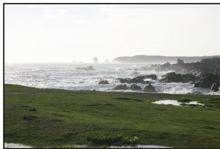
Sea stacks and heavy wave action, looking east from Dungeon Provincial Park, Cape Bonavista, NL.

the special session entitled, Preservation of Geological Heritage and Its Contribution to Education and Economic Development .