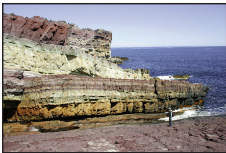
Multi coloured layers, Brook Point, Kings Cove, Bonavista Peninsula.

coves and communities spanning the coast.