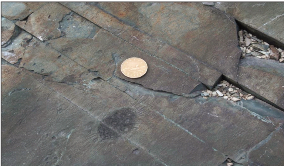
Hiemalora, Murphy's Cove, NL.

This trip will also include visits to sites of colourful historic and cultural significance, including the union-built town of Port Union; Cape Bonavista Lighthouse; Elliston, the 'Root Cellar Capital of the World'; King's Cove and numerous scenic