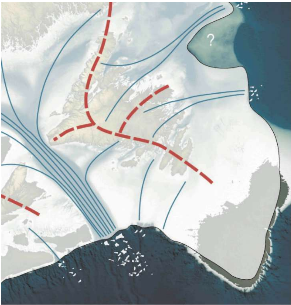
Figure 1. Conceptual model of the ice cover over Newfoundland during the last glacial maximum (modified from Shaw et al. 2006). Red dashed line indicates ice divide or ridge, thin blue lines represent generalized ice-flow trajectories.

sensitive to the number of measurements made.